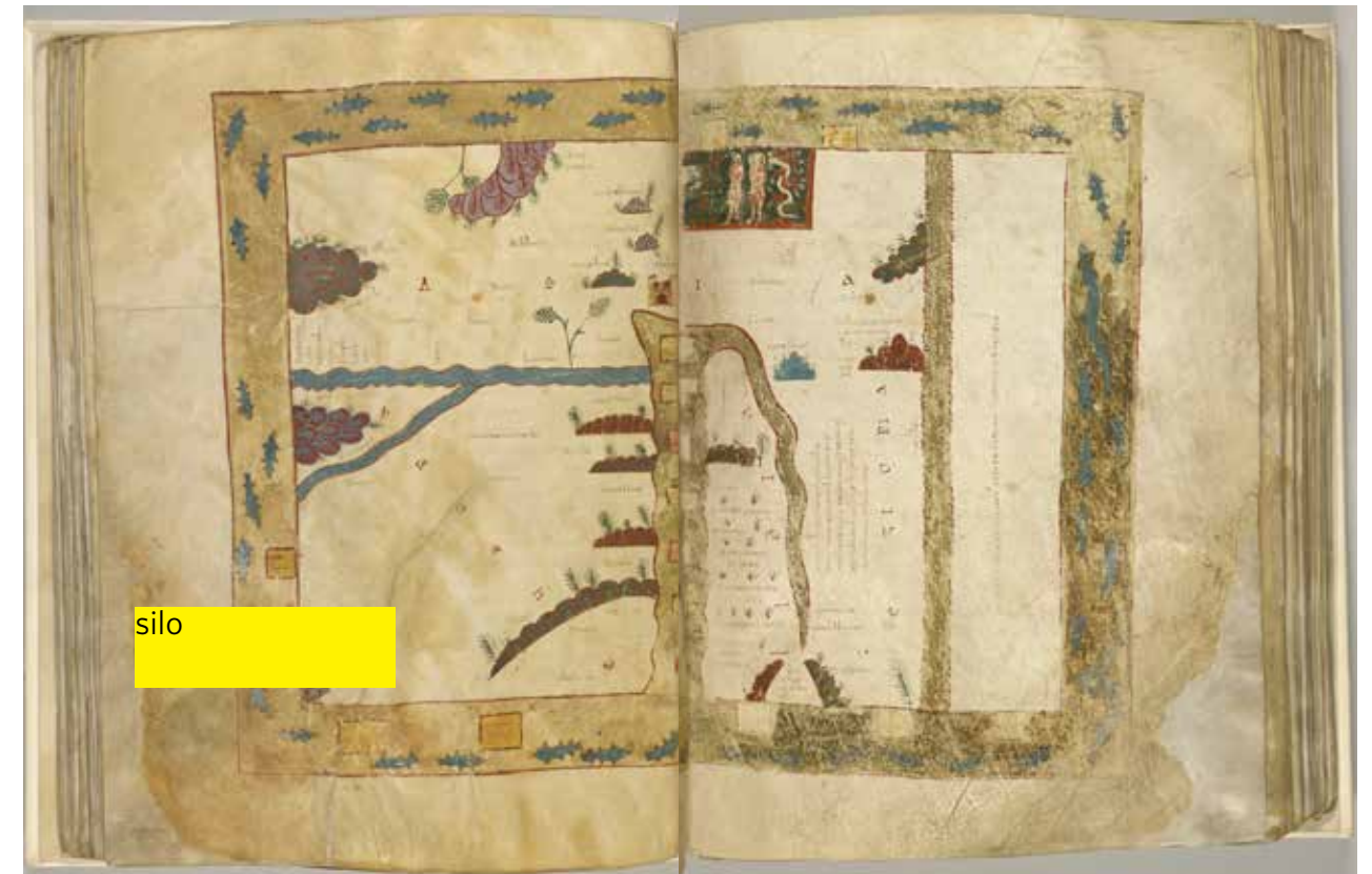
4.3. Beatus map in an Apocalypse , San Salvador de Taibara, Spain, 945. New York, The Morgan Library and Museum, MS M. 644, fols. 33v–34

In theological terms, Ethiopia was understood as a place of special grace and apocalyptic expectation. In the Hebrew Bible, the story of Solomon and Sheba was interpreted in terms of a mystical union that brought the earthly Jerusalem into contact with the southern riches of Ethiopia; in the Acts of the Apostles, the queen of Ethiopia, named Candace, is identified as the ruler of the Ethiopian eunuch who converts to Christianity. Apocryphal stories of the Magi, seen in a twelfth-century Beatus manuscript from San Pedro de Cardeña (1175–85; New York, The Metropolitan Museum of