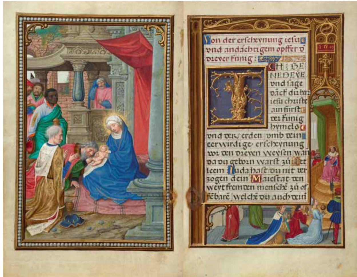
4.4. The Adoration of the Magi and border with The Queen of Sheba before King Solomon in the Prayer Book of Cardinal Albrecht of Brandenburg, Simon Bening, Bruges, Belgium, 1525–30. Los Angeles, The J. Paul Getty Museum, Ms. Ludwig IX 19 (83.ML.115), fols. 36v–37

IX 12), show exotic dress but only moderate differences of physiognomy, while others, as in the Prayer Book of Albrecht of Brandenburg illuminated by Simon Bening (ca. 1483–1561), show bodily diversity more vividly, with black skin (fig. 4.4). Like the Ethiopian magus, depictions of the Queen of Sheba also vary in how they portray ethnicity. While there was a rich medieval commentary tradition on the Song of Songs that interpreted the allegory of the beautiful and black bride in historical terms, as the Ethiopian Queen of Sheba, pictorial