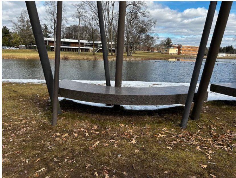
The Benchmark: "Those who have moved the world have usually been those who have followed the will-o'-the-wisp of their own intellectual and spiritual curiosity" – Abraham Flexner, first director (1930–1939)

what a Platform School might look like. 3 The IAS was a place built for experiments, for the contemplation of Natural and Mathematical Sciences, with both Seriousness Of Purpose, and a call (as it says on the marked bench as though Einstein and assorted Great Men sat there) to follow the will-o'-the-wisps from within, those most gentle ideas that flutter away when pursued too closely. If the atomic bomb, or rather, the effort to redeem knowledge after its creation, animated this place when Oppenheimer was appointed its longest serving Director, is a benchmark that lingers in the air and the bones of this place, how might we use this platform to sit with the intellectual challenge of the Platform?