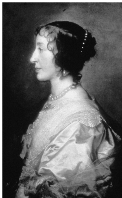
7. Anton van Dyck, Queen Henrietta Maria. Windsor Castle.