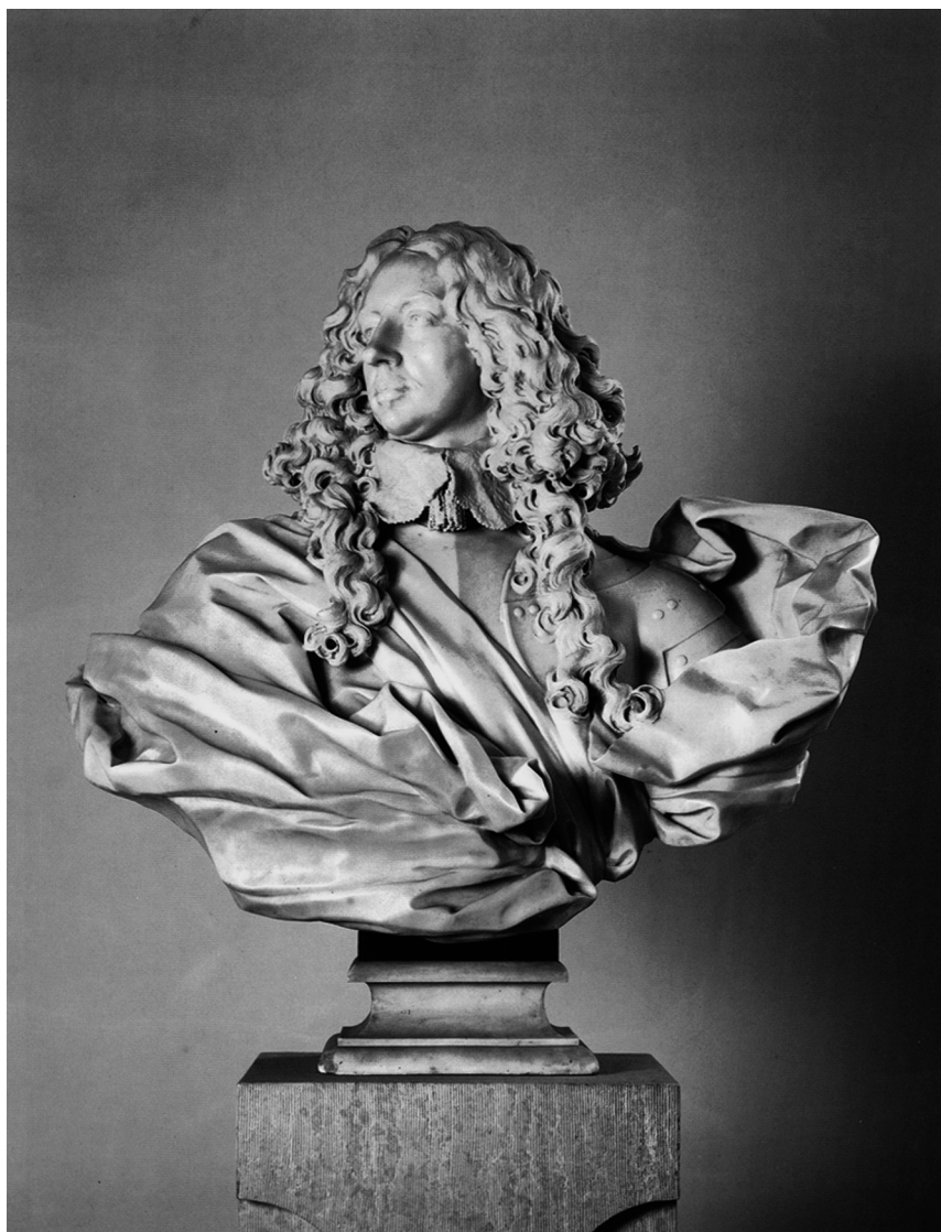
1. Bernini, Francesco I d'Este, Museo Estense, Modena.