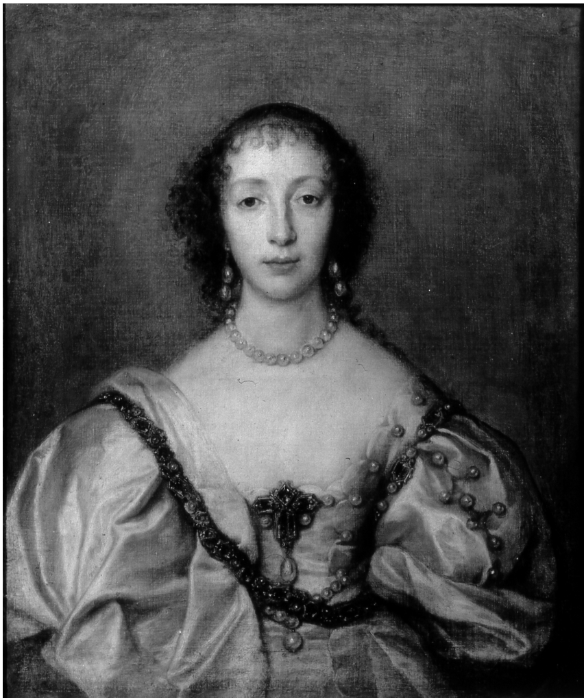
8. Anton van Dyck, Queen Henrietta Maria. Windsor Castle.