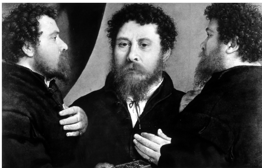
4. Lorenzo Lotto, triple portrait. Kunsthistorisches Museum, Vienna.