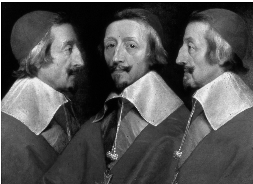
10. Philippe de Champaigne, triple portrait of Richelieu. National Gallery of Art, London.