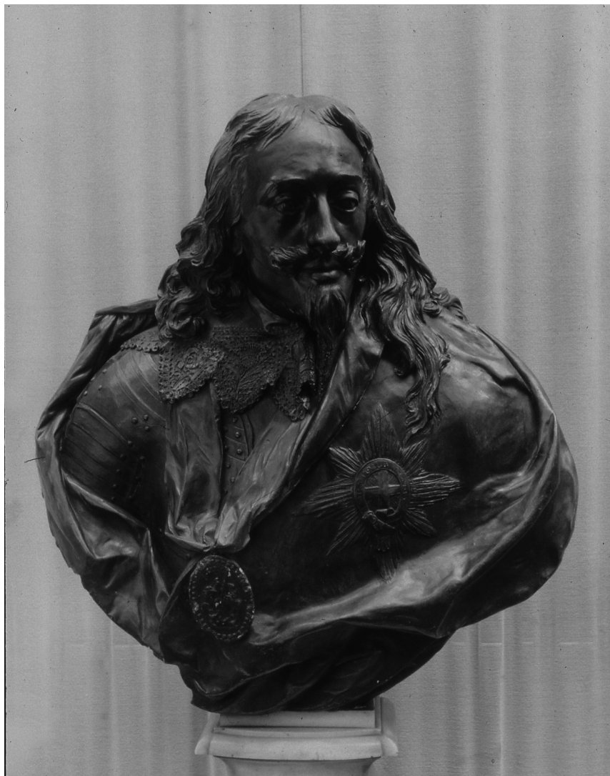
13. Louis-François Roubiliac (?), Charles I, Courtauld Institute Galleries, London.