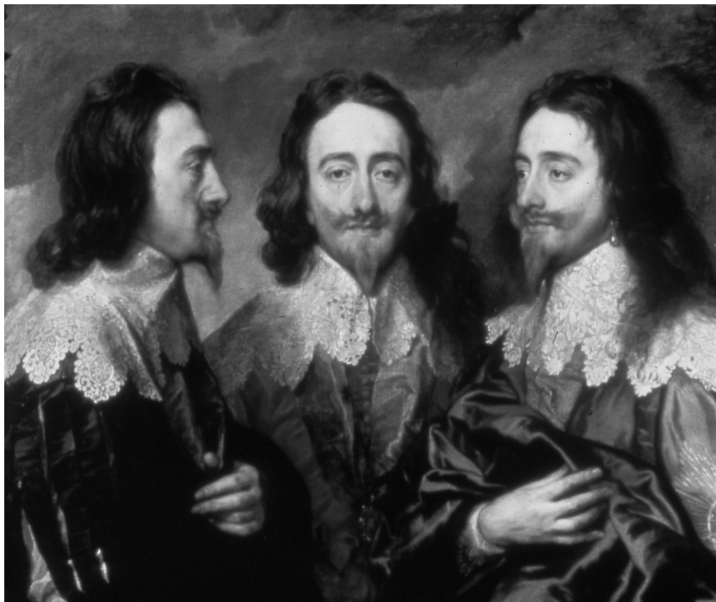
5. Anton van Dyck, triple portrait of Charles I. Windsor Castle.