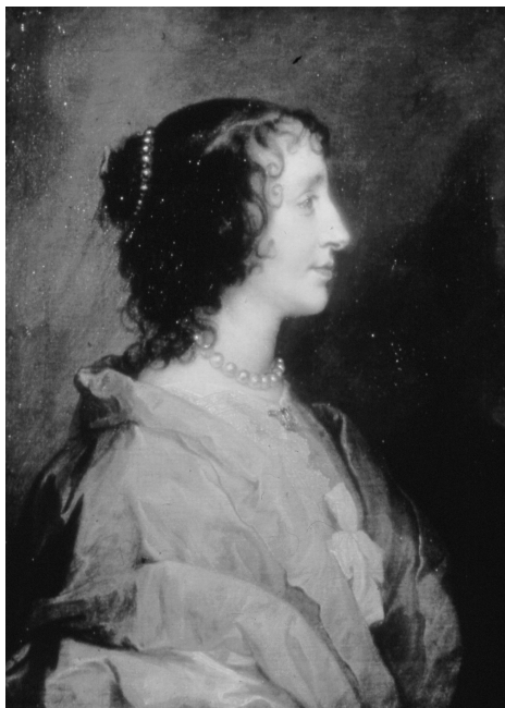
6. Anton van Dyck, Queen Henrietta Maria. Brooks Memorial Art Museum, Memphis, TN .