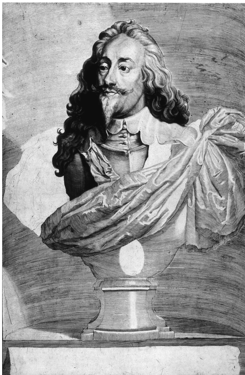
11. Attributed to Robert van Voerst, Charles I, engraving. British Museum, London.