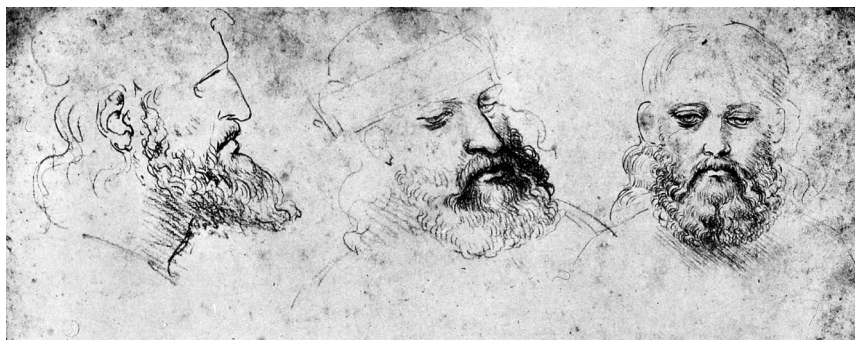
3. Leonardo da Vinci, three heads, drawing. Biblioteca Reale, Turin.