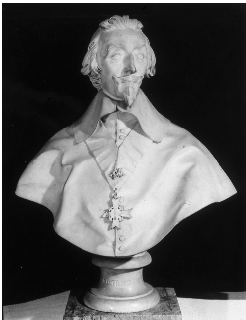
9. Bernini, Cardinal Richelieu. Musée du Louvre, Paris.