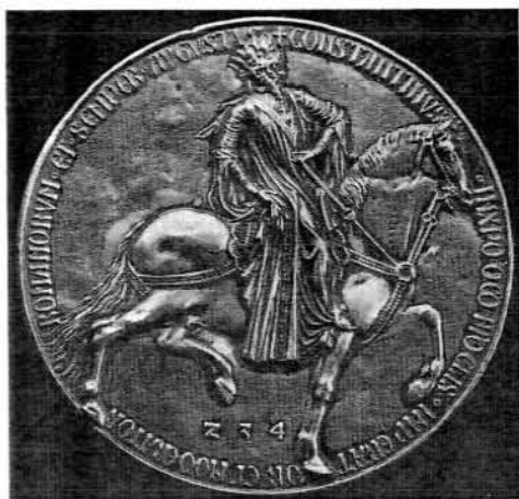
4 Medal of Constantine, 1402