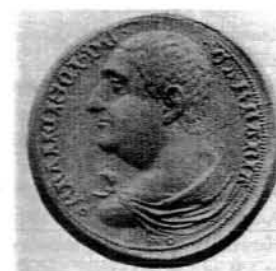
2 Medal of Francesco I da Carrara, 1390