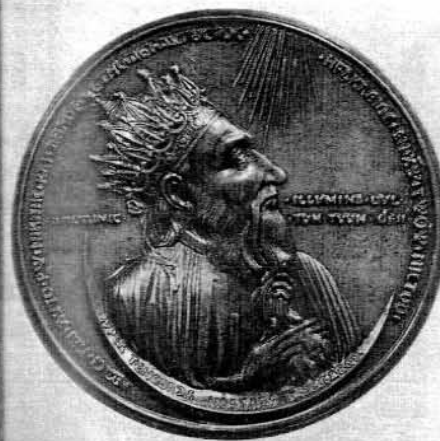
5 Medal of Heraclius, 1402