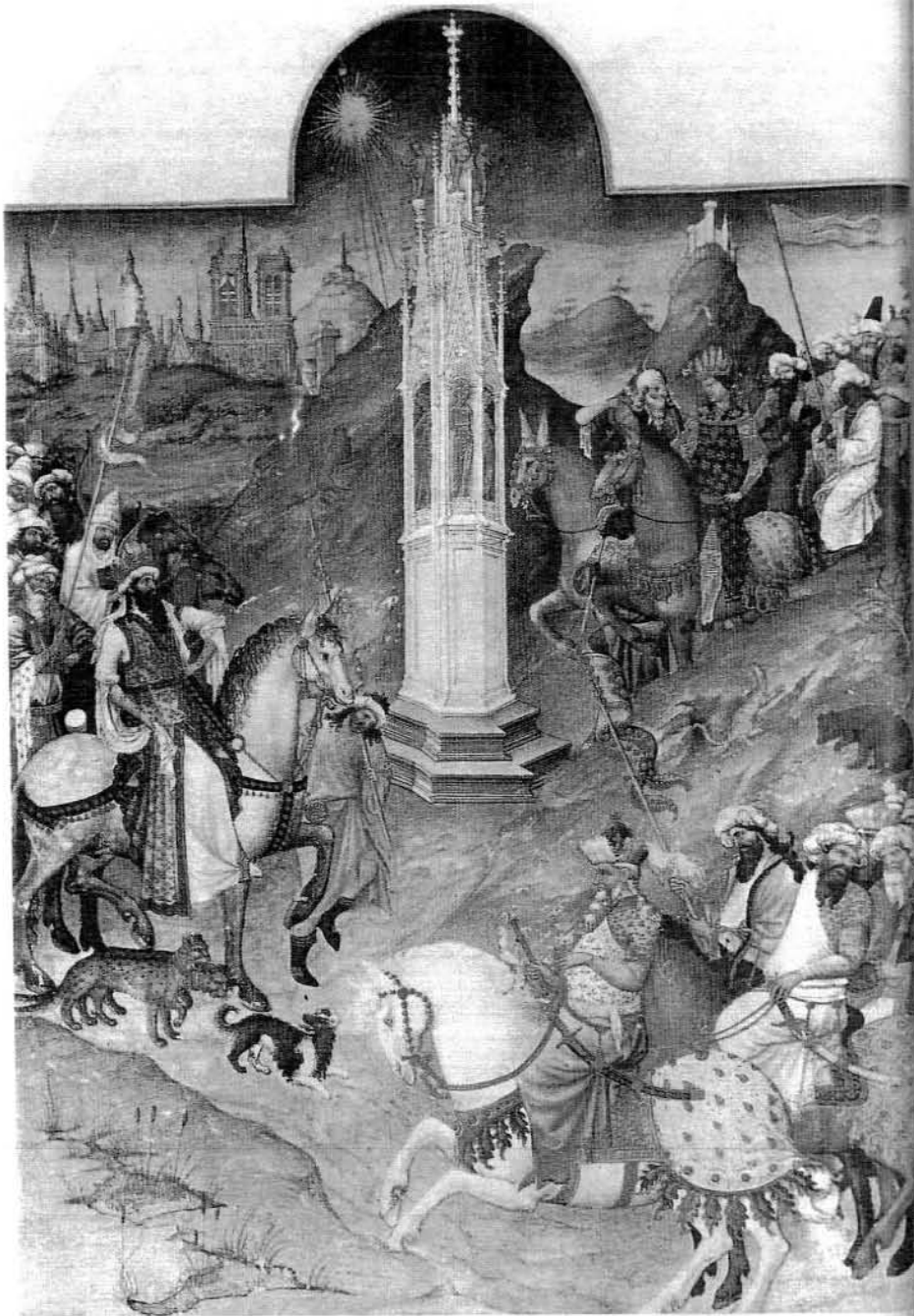
8 The Limbourg Brothers, The Meeting of the Magi, ca. 1411–16. Très Riches Heures, fol. 51v. Chantilly, Musée Condé