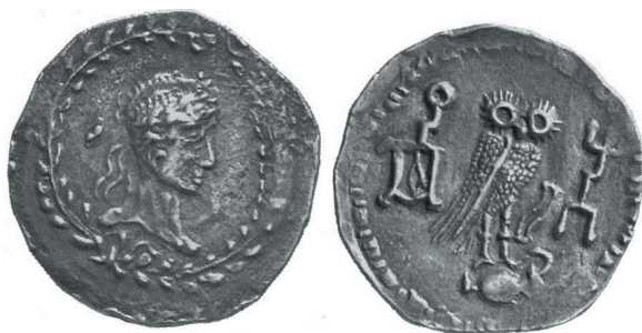
FIG. 2.—The coin of Al-maqah with a presumed image of Augustus, from Huth (n. 20 above).