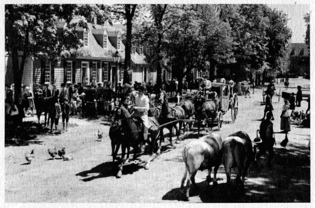
A scene from the new orientation film, Williamsburg, the Story of a Patriot.