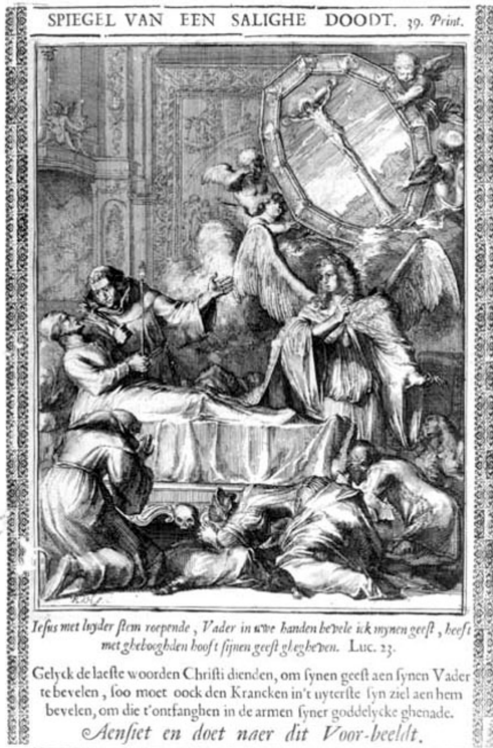
Fig. 8 The Death of Moriens , engraving by R. de Hooghe from D. de la Vigne, Spiegel van een salighe Doodt , Antwerp, 1763 (?) New York Public Library