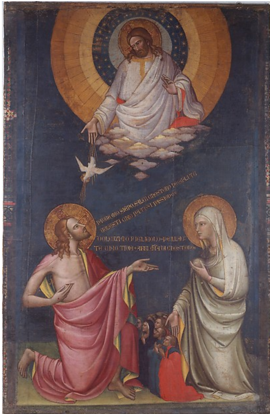
Fig. 4 Lorenzo Monaco (attributed), Double Intercession . New York, Cloisters, Metropolitan Museum