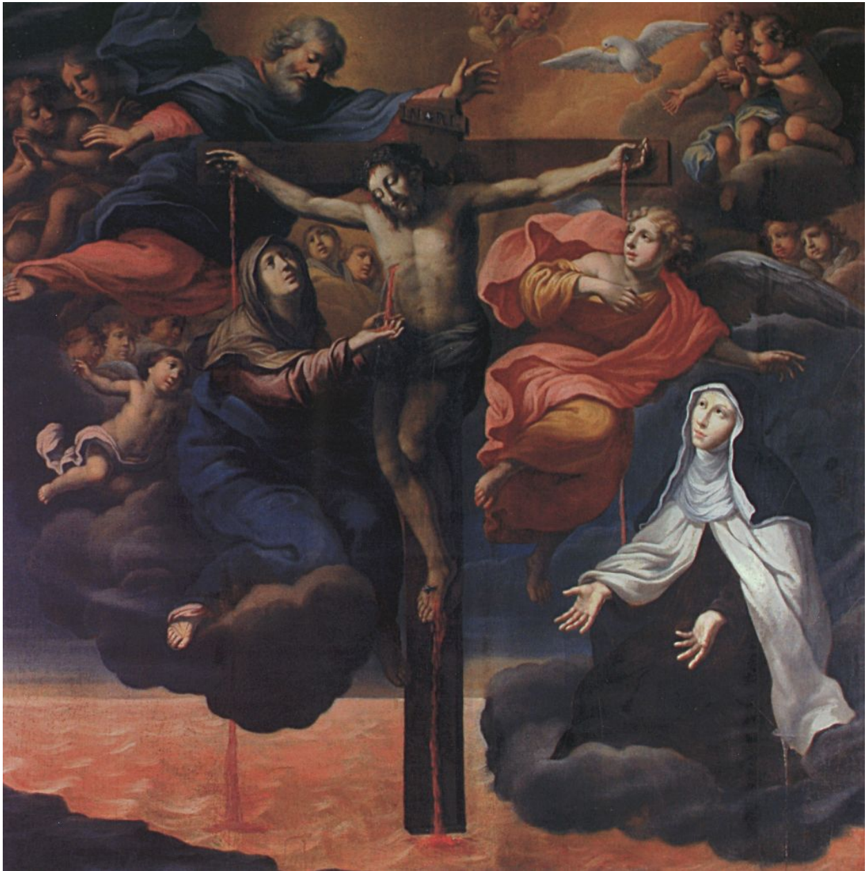
Fig. 9 Anonymous Master, Sanguis Christi . Jesi, Monastero della SS Trinita