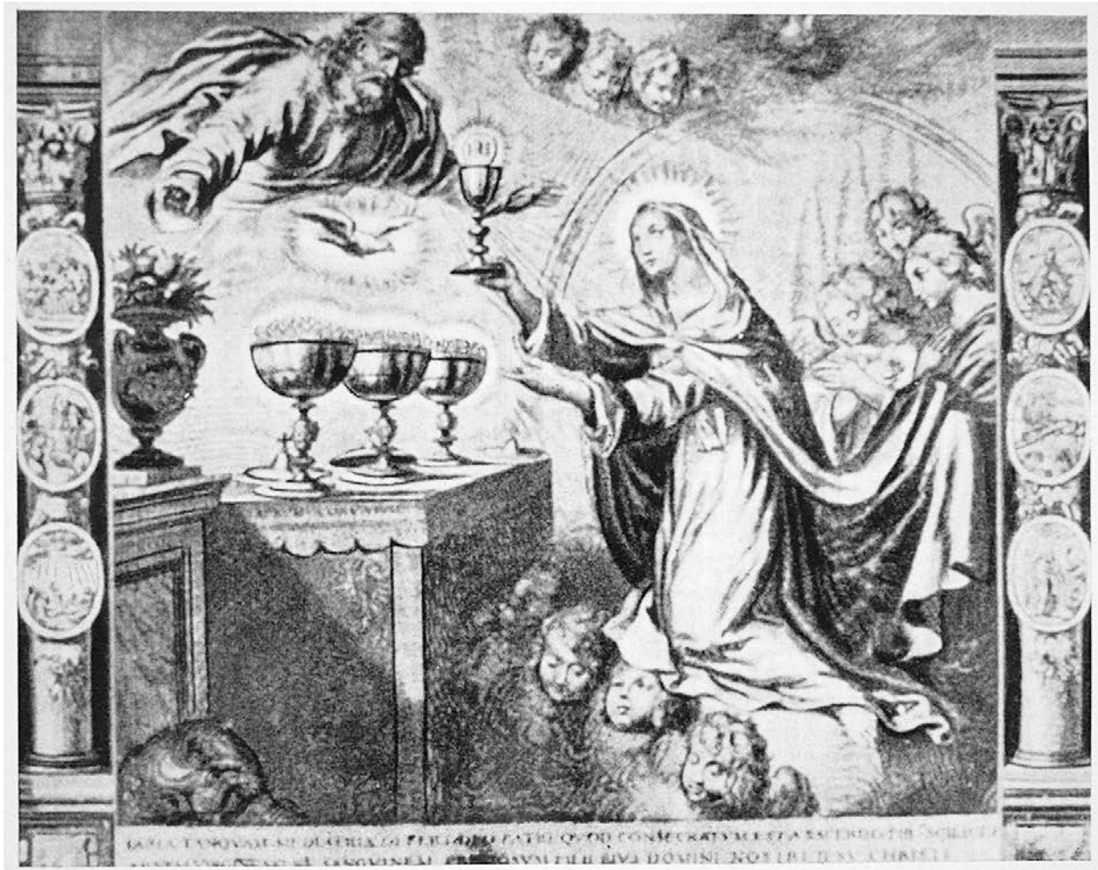
Fig. 5 Mary as Priest offering the Chalice of the Sacrament to the Trinity , engraving. Brussels, Jumpers Collection