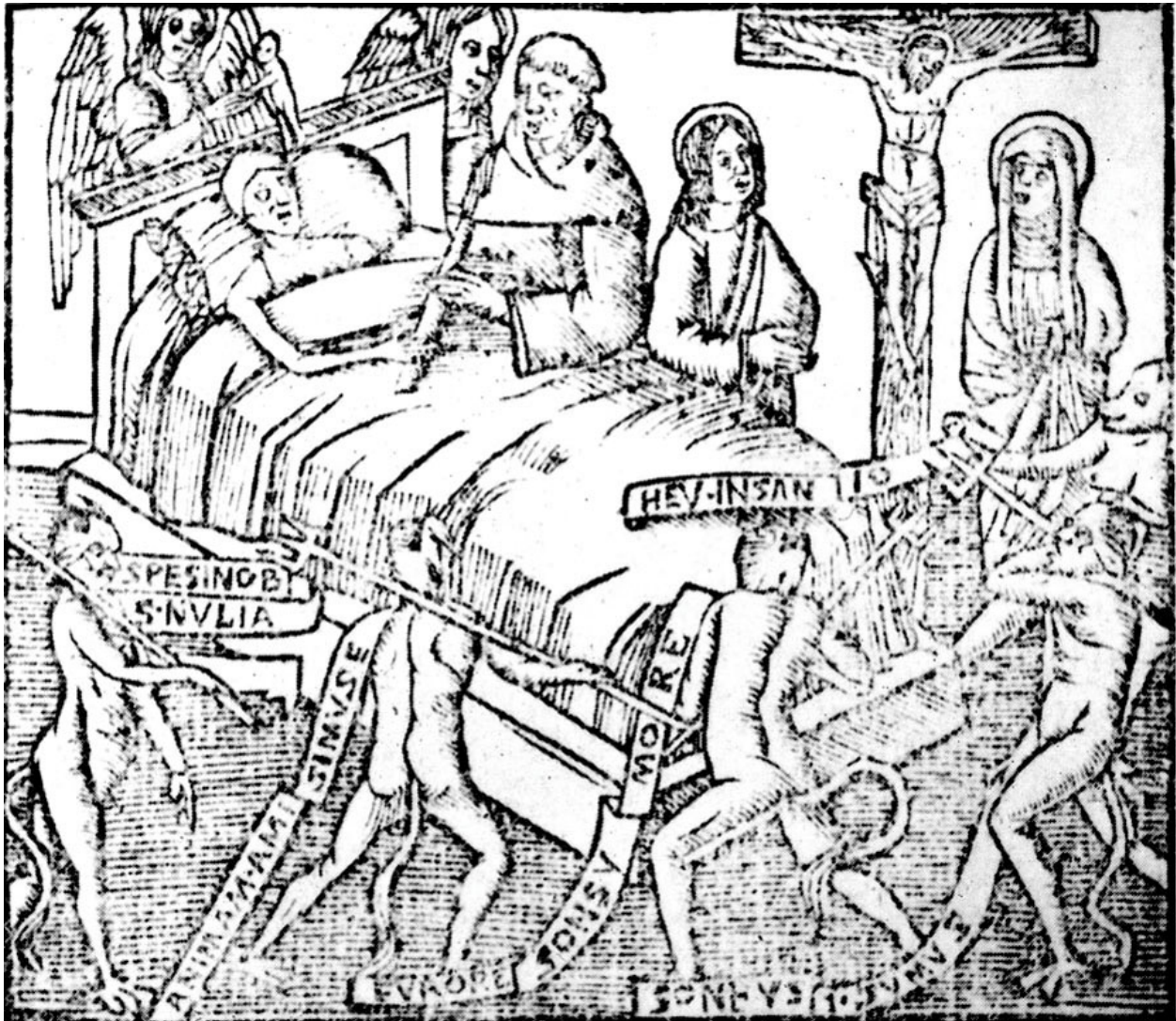
Fig. 6 The Death of Moriens , woodcut from Dell'arte del ben morire , Naples 1591.