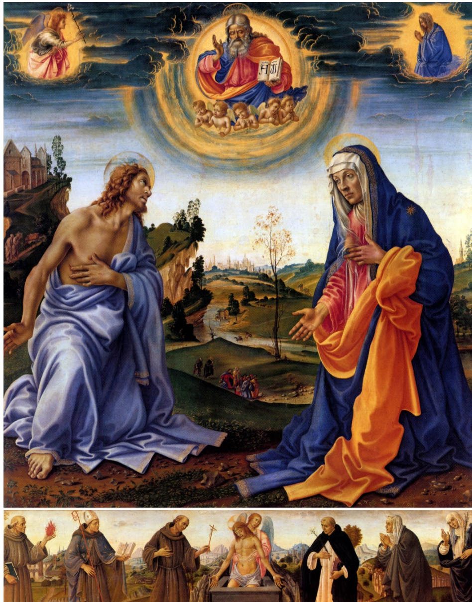
Fig. 3 Filippino Lippi, The Intercession of Christ and the Virgin . Munich, Alte Pinakothek.