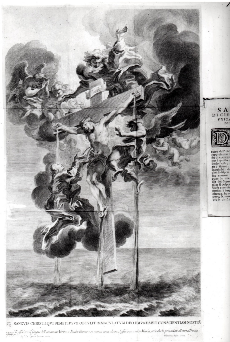
Fig. 1 Gianlorenzo Bernini, Sangue di Cristo , engraving by F. Spierre, 473 x 290mm, frontispiece of F. Marchese, Unica speranza del peccatore , Rome 1670, Vatican Library