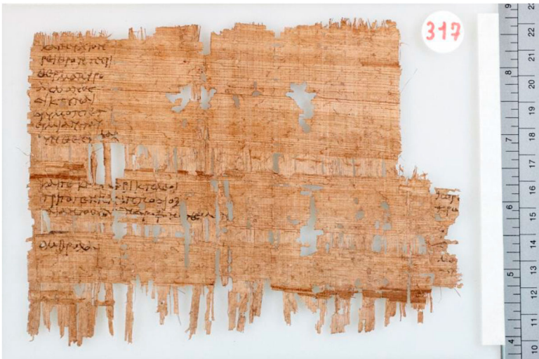
Figure 4. P.Monts.Roca inv. 317.