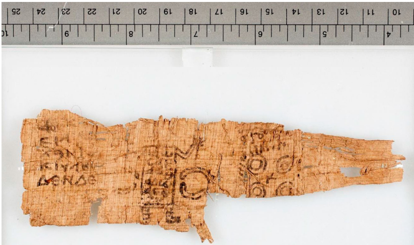
Figure 1. P. Monts.Roca inv. 980.

Since these kinds of drawings start appearing in magical texts at a later period, we are inclined to date this papyrus to the 5th century at the earliest. 12 The paleography and the text are not helpful in this respect.