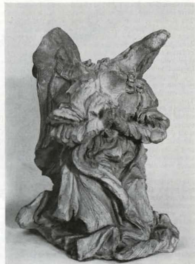
6/ 7. Angel for the Sacrament Altar , 1673. Terracotta, height 29.2 cm. 1937.65. One of the bozzetti for Bernini's first version for the angels of the altar of the Holy Sacrament in St. Peter's