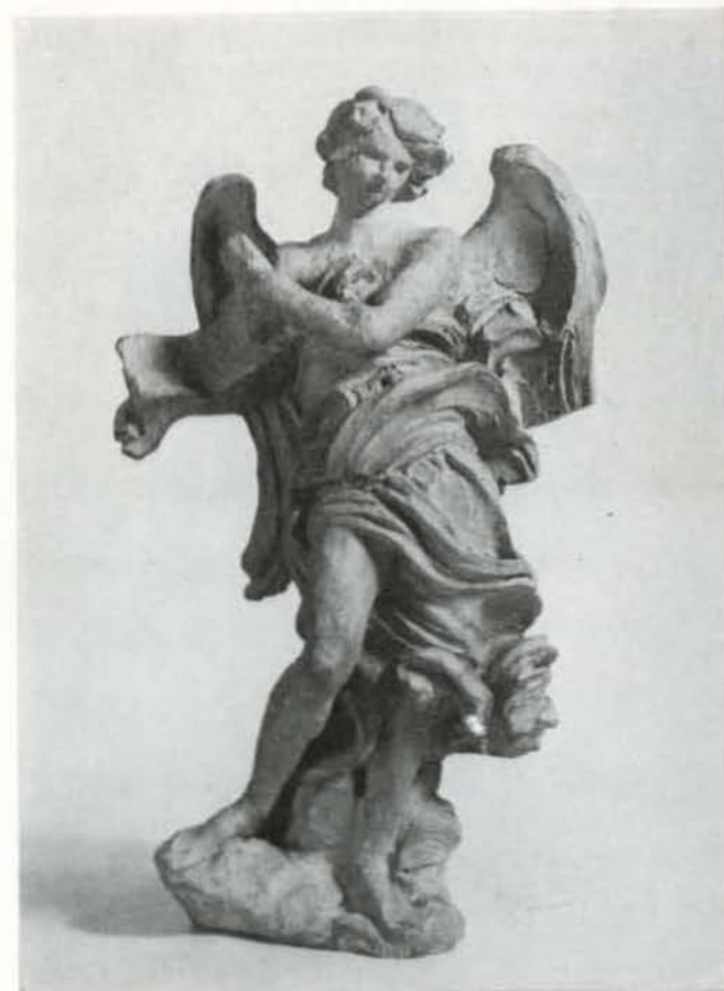
4. Angel with the Inscription , 1667–68. Terracotta, height 29.2 cm. 1937.67