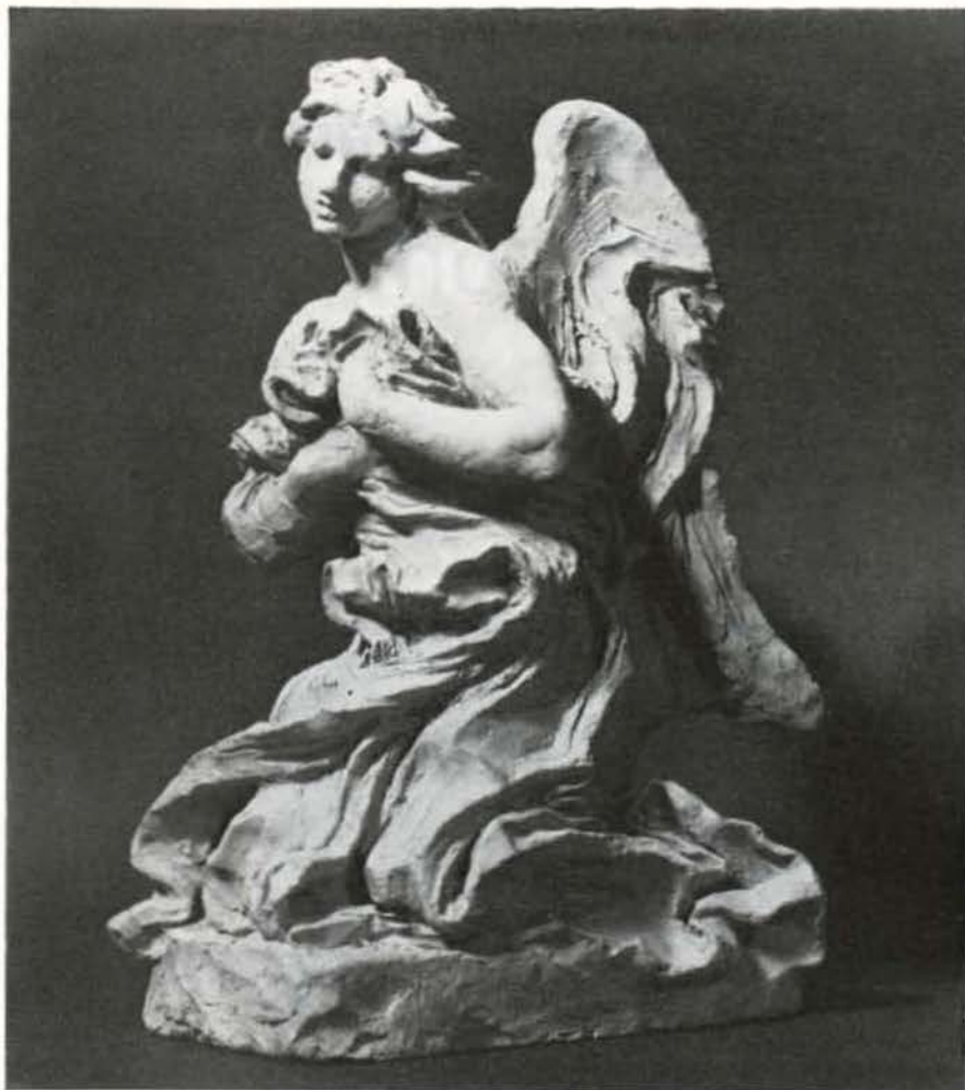
10. Angel for Sacrament Altar , 1673. Terracotta, height 34 cm. 1937.63. Another view of Figure 11, this shows incised calibrations on the base