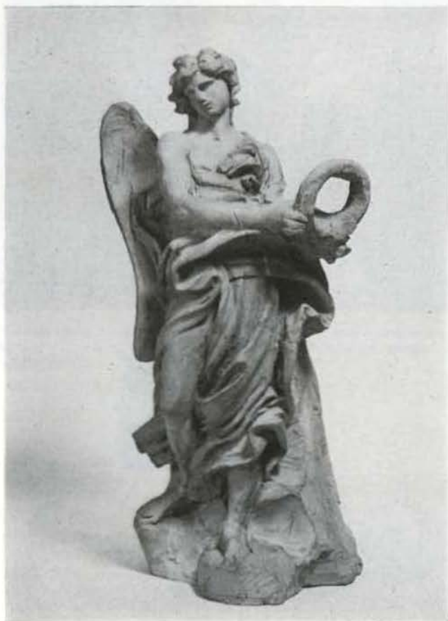
6. Angel with the Crown of Thorns , 1667–68. Terracotta, height 44.5 cm. 1937.57

rejection of his violent worldly profession in favour of the religious life of peace. The pose not only imitates the crucifixion, but everything in the composition strains upward in great, sweeping diagonals toward the cross that was placed atop the baldachino over the high altar. Technically the study is unusual among those remaining by Bernini. It is 52.7 cm. high, rather larger in scale than the very small sketches, which average around 30 cm.; it is smoothly finished and gilt, with the texture of the armour carefully indicated by little pin-pricks; and it is hollowed at the back for firing (the others must have been lightly baked, but would have cracked under very high temperatures). All this indicates that the model had a special purpose; perhaps Bernini used it to demonstrate his novel idea for the figure to the governing body of the works at St. Peter's.