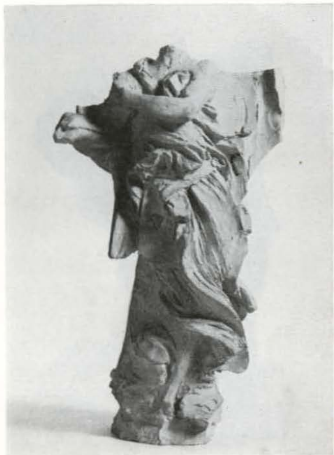
3. Angel with the Inscription , 1667–68. Terracotta, height 28.3 cm. 1937.69. This and Figure 4 are models for the first version of the Angel with the Inscription

Among the earliest and most important of the Fogg terracottas is that for the colossal marble figure of St. Longinus which the artist made in the 1630s and '40s for one of the niches in the piers that support the dome of St. Peter's in Rome (Plate V). The model documents the birth of one of Bernini's most revolutionary conceptions—a figure with both arms outstretched, and therefore in utter defiance of the self-contained silhouette and closed form that had been conventional for the monumental standing figure in marble. The work alludes to the Roman centurion's sudden conversion at the moment when he pierced the side of Christ on the Cross with his lance. The event itself is not represented, however; instead, Bernini created an ideal moment of self-realization in the crucifixion, to which the saint bore double witness, as it were, through his actual participation and ultimately through his own martyrdom. The shield and helmet at Longinus's feet refer to his subsequent