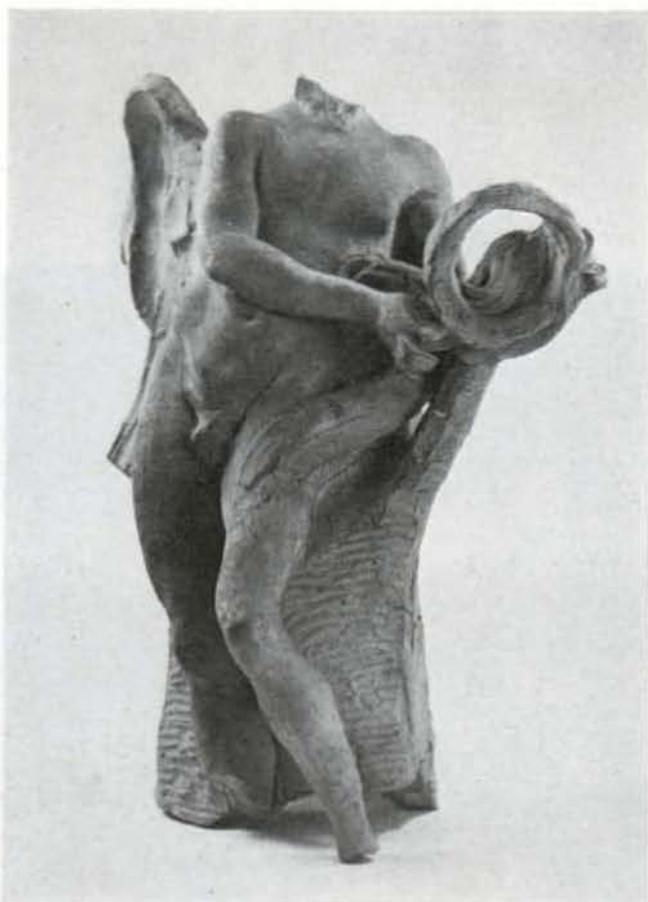
5. Angel with the Crown of Thorns , 1667–68. Terracotta, height 33.7 cm. 1937.58. This and Figure 6 are models for the Angel illustrated in Figure 2