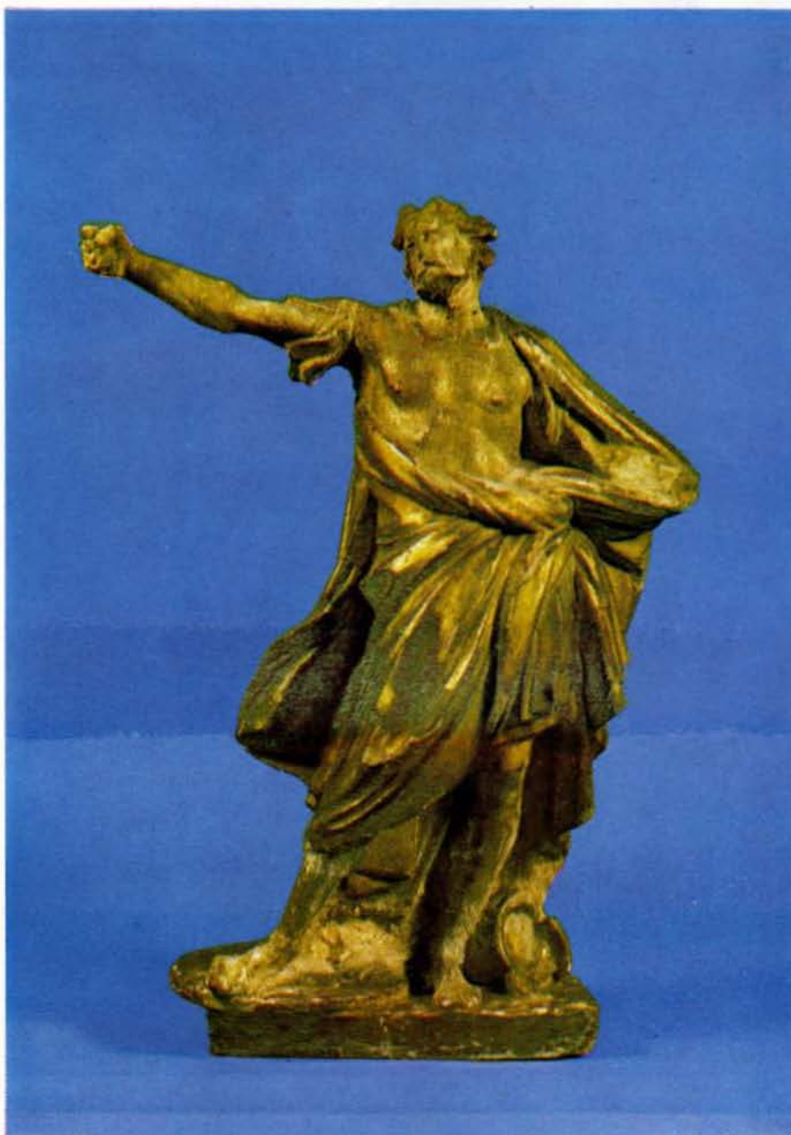
Plate V. St. Longinus , 1630–31. Terracotta, height 52.7 cm. 1937.51. One of the terracottas for the colossal marble figure of St. Longinus in one of the niches in the piers that support the dome of St. Peter's in Rome

Although the making of models in preparation for works in sculpture might seem to be a natural, and is in fact a very ancient practice, it does not by any means enjoy a continuous history. 4 Many Egyptian sculptors' models are preserved, and the use of models in classical antiquity is amply documented. In the Middle Ages, however, the practice was replaced by the method commonly described as 'direct carving', that is, the work was conceived and executed simultaneously, as it were, without advanced preparation of this sort; the creative process, born of a millennial craft tradition, was unified, internal and automatic. The sculptural model was reborn in the Renaissance, when it acquired new forms and vitality it had never had before. Its reappearance, both as an integral part of the sculptor's working