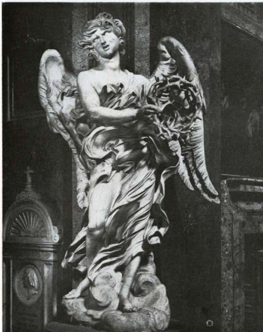
2. Angel with the Crown of Thorns , 1668–69. Marble, over life-size. Church of Sant' Andrea della Fratte, Rome. Originally intended for the Ponte Sant' Angelo, but considered too fine to remain outside

procedure and as an aesthetically appreciated art object, went hand in hand with the emergence of a coherent theory of the creative process itself. In the sixteenth century elaborate treatises, notably by Vasari and Benvenuto Cellini, lay considerable stress upon successive stages in the preparation of a work, and directions for making a sequence of models are set forth in detail. From the same period, and beginning especially with Michelangelo, various model-types are preserved which correspond more or less with these prescriptions: the small, rapidly executed bozzetto ; the more carefully finished intermediate study; and the full-scale model of which the final work is essentially the duplicate in a permanent material. Paradoxically, therefore, the record of the artist's spontaneous creative activity emerged as the creative process itself became more discrete, external and deliberate.