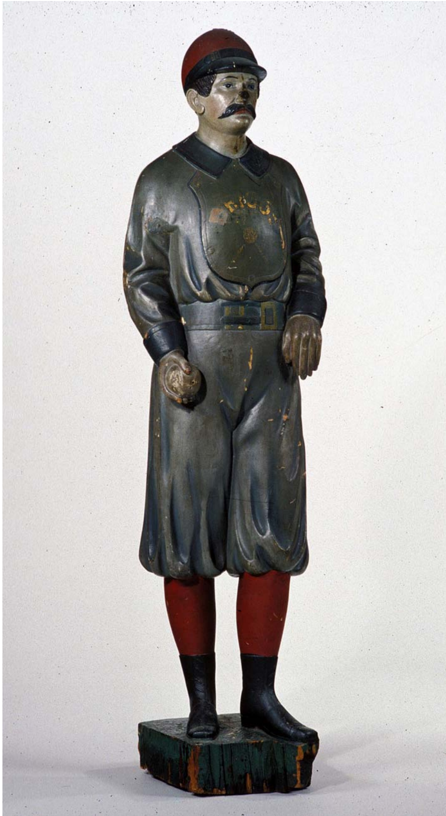
Fig. 2 Unknown American (New York, New York), Baseball Player (shop sign), painted wood, about 1880. Hood Museum of Art, Dartmouth College, Hanover, NH