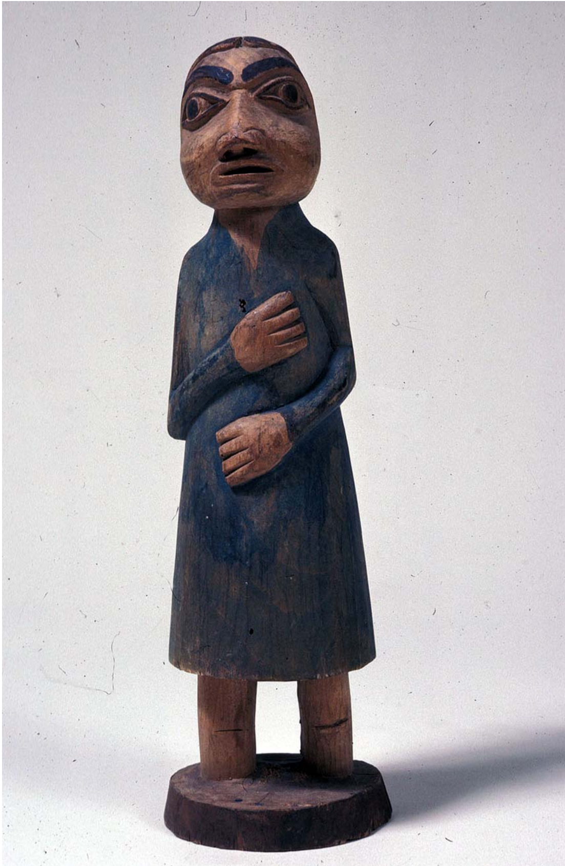
Fig. 1 Male wooden figure carved by Haida Indians , British Columbia, 19th century. Hood Museum of Art, Dartmouth College, Hanover, NH