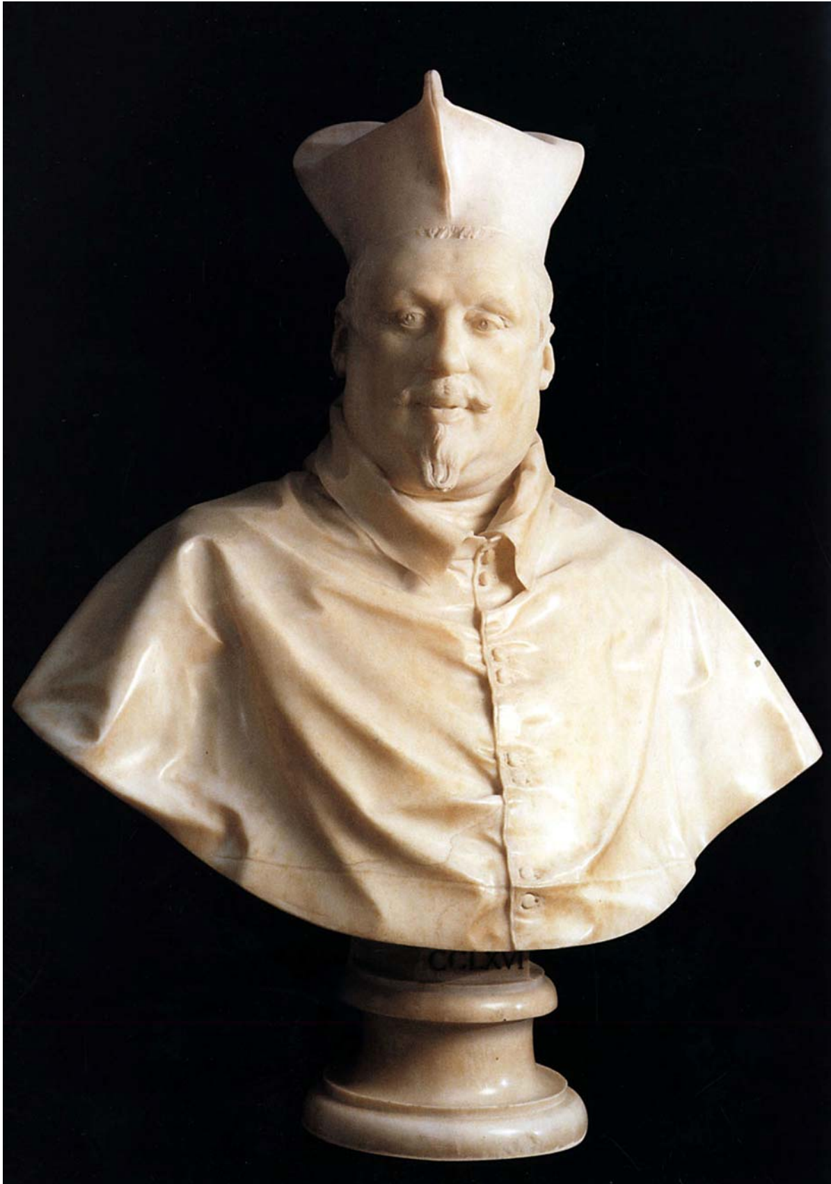
Fig. 10 Bernini, Bust of Cardinal Scipione Borghese, 1632, marble. Villa Borghese, Rome.