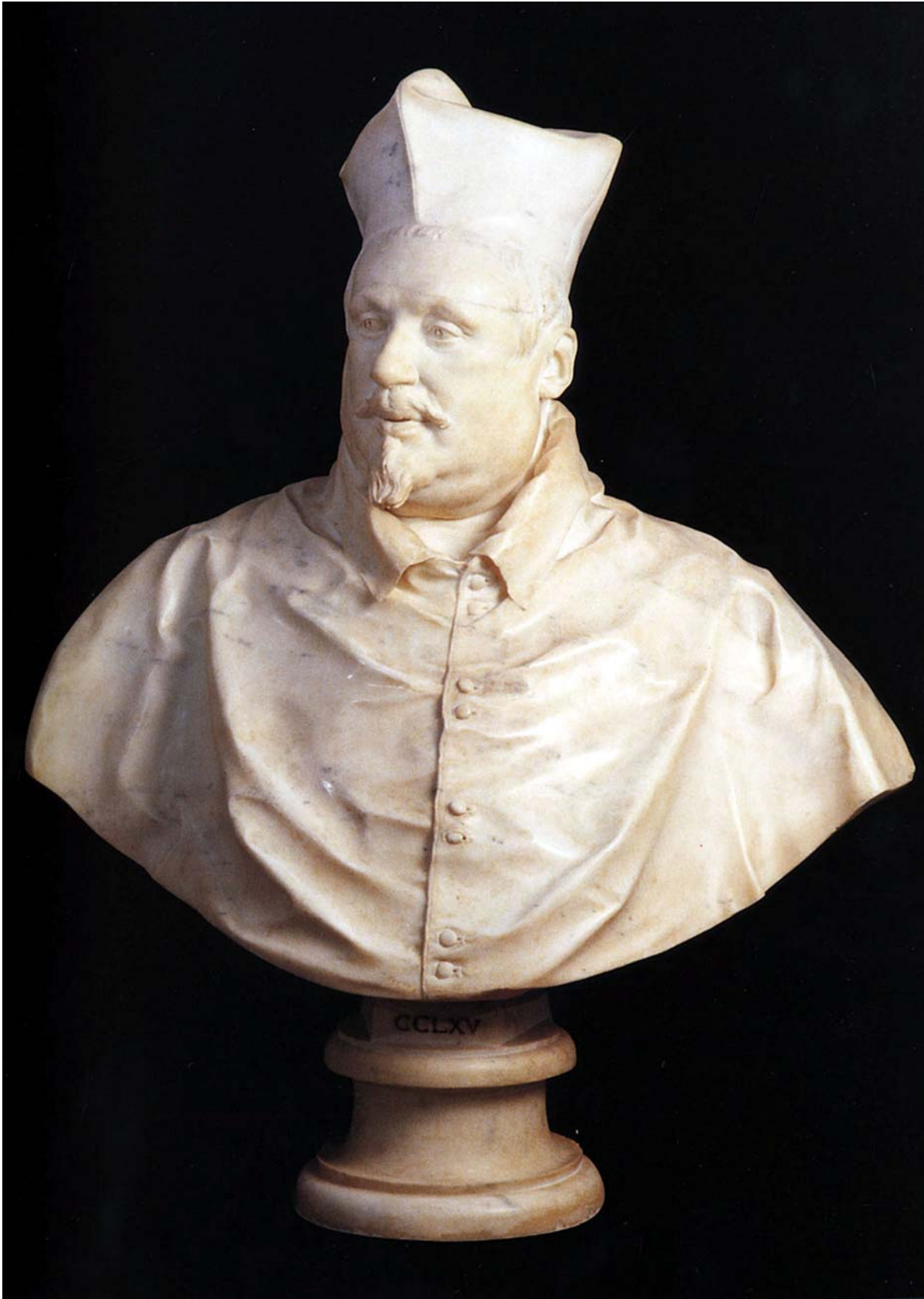
Fig. 9 Bernini, Bust of Cardinal Scipione Borghese, 1632, marble. Villa Borghese, Rome.