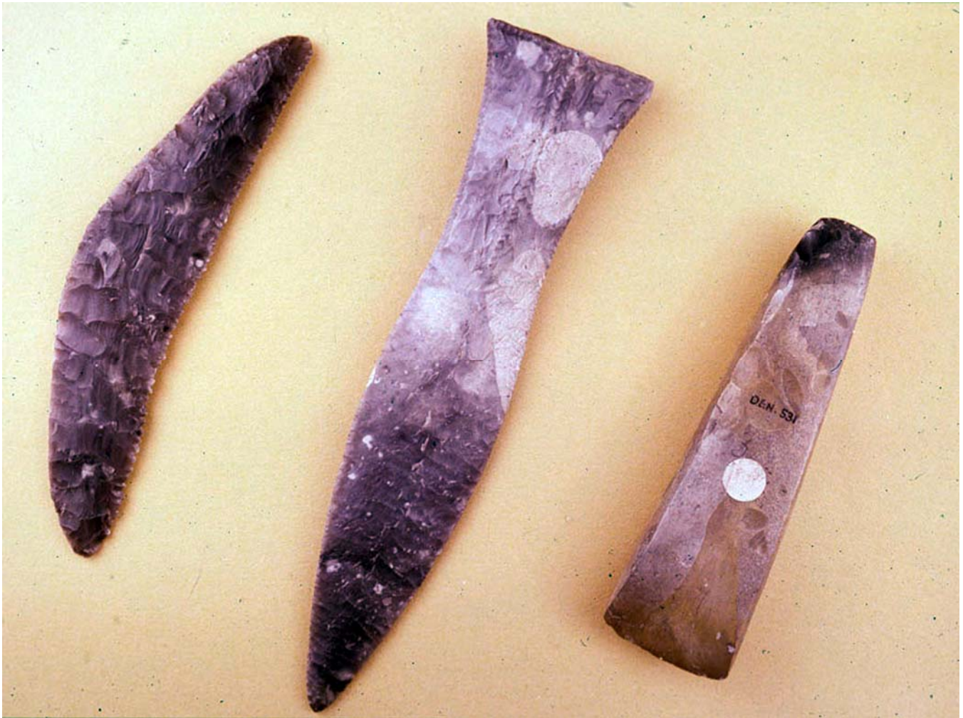
Fig. 12 Three flint implements: sickle, dagger, gouge, Scandinavia, ca. 2200-2300 B. C. British Museum, London.