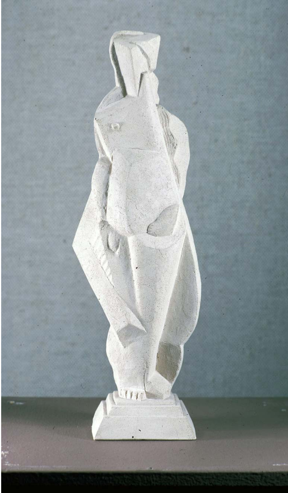
Fig. 3 Henri Laurens, Standing Female Nude , unglazed buff terracotta, 1921. Hood Museum of Art, Dartmouth College, Hanover, NH (click here to return to text)