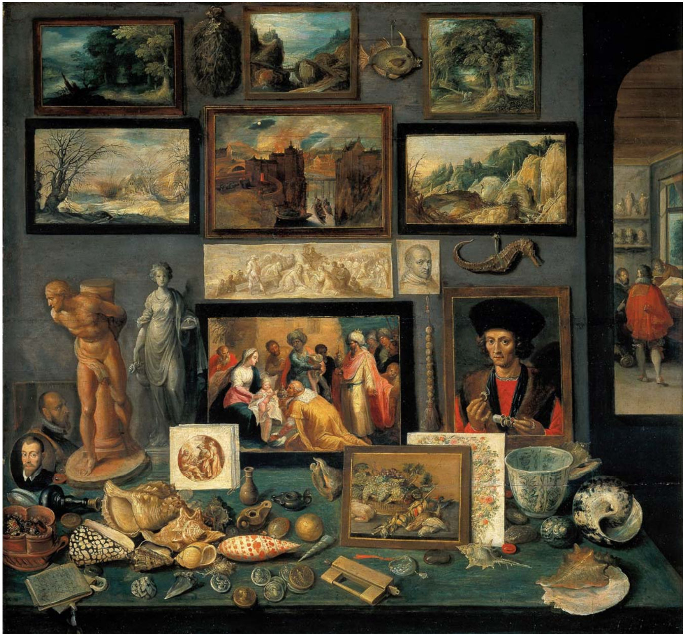
Fig. 8 Frans Francken the Younger, Kunstkamer, 1636. Kunsthistorisches Museum, Vienna.