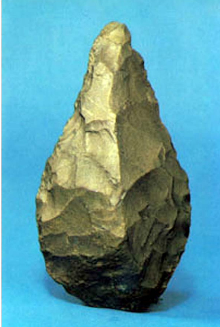
Fig. 14 Axehead, Museo civico archeologico di Bologna.