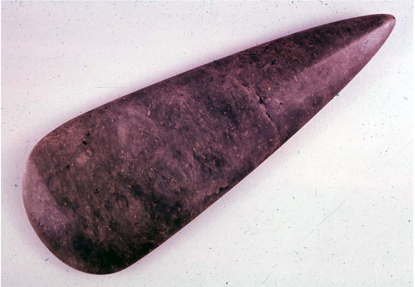
Fig. 13 Axehead, jadelite, Canterbury, Kent, ca. 3000 B. C. British Museum, London.