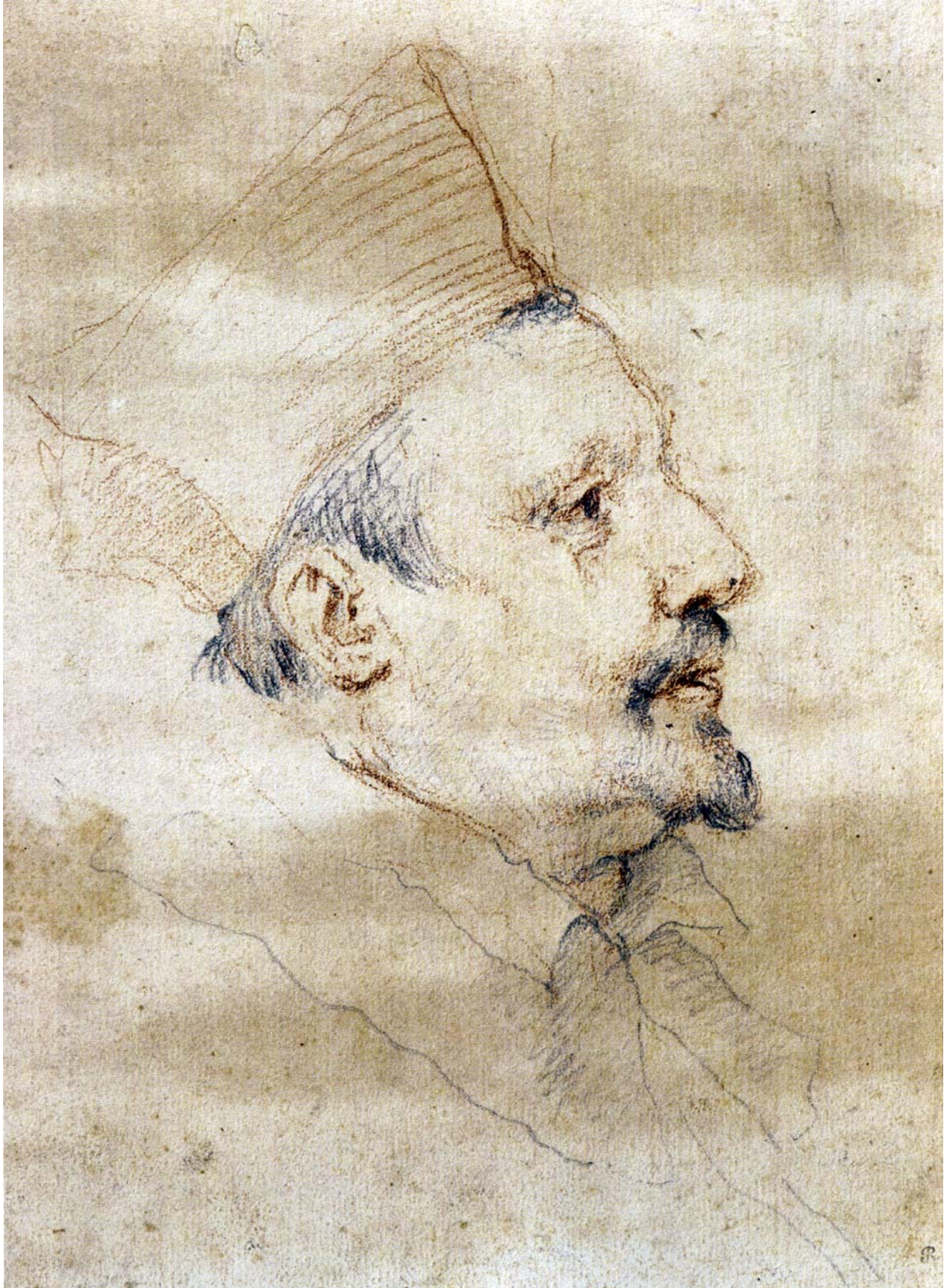
Fig. 4 Bernini, Cardinal Scipione Borghese, drawing. Pierpont Morgan Library, New York.