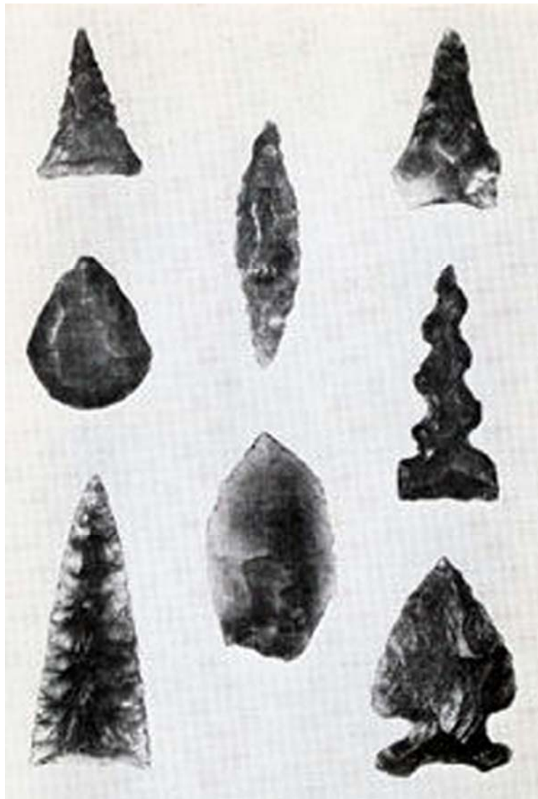
Fig. 11 "Neolithic arrow-heads showing delicate workmanship." Walter Shepherd, Flint, its Origin, Properties and Uses , London, 1972, pl. XXVI