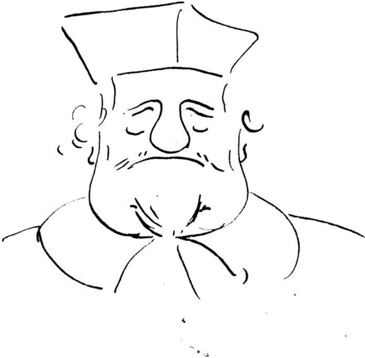
Fig. 5 Bernini, Caricature of Cardinal Scipione Borghese, drawing. Biblioteca Vaticana, MS Chigi P. VI. 4, fol. 15.