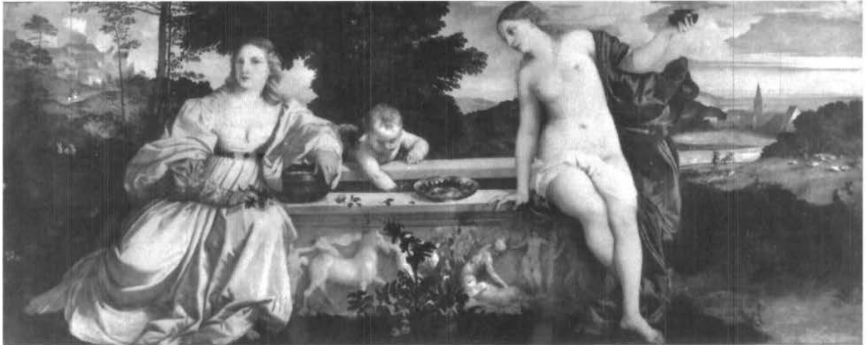
Figure 3. Titian, Sacred and Profane Love . Galleria Borghese, Rome

first to hear clearly, take seriously, and apply systematically to all art, what artists since the Renaissance—Leonardo, Raphael, Dürer, Michelangelo, Titian, and the rest—were saying, sometimes desperately: that art is also a function of the brain, that man can speak his mind with his hands. Whereas his predecessors were concerned mainly with the classification of artists, styles, and periods, or with the social, religious, and political contexts in which art was produced, or with the psychological and formal principles that determine its various forms, Panofsky was concerned first, last, and foremost with meaning. The artist had something special to say and found special ways to say it. (Panofsky wrote a miraculous essay on precisely this subject with respect to what would now be called “filmic” technique. 3 ) It was this insistence on, and search for, meaning—especially meaning in places where no one suspected there was any—that led Panofsky to understand art, as no previous historian had, as an intellectual endeavor on a par with the traditional liberal arts like literature and music; and in so doing he made art history into something it had never been before, a humanistic discipline. It was this elevating, intellectual approach—not to mention, of course, the bril-