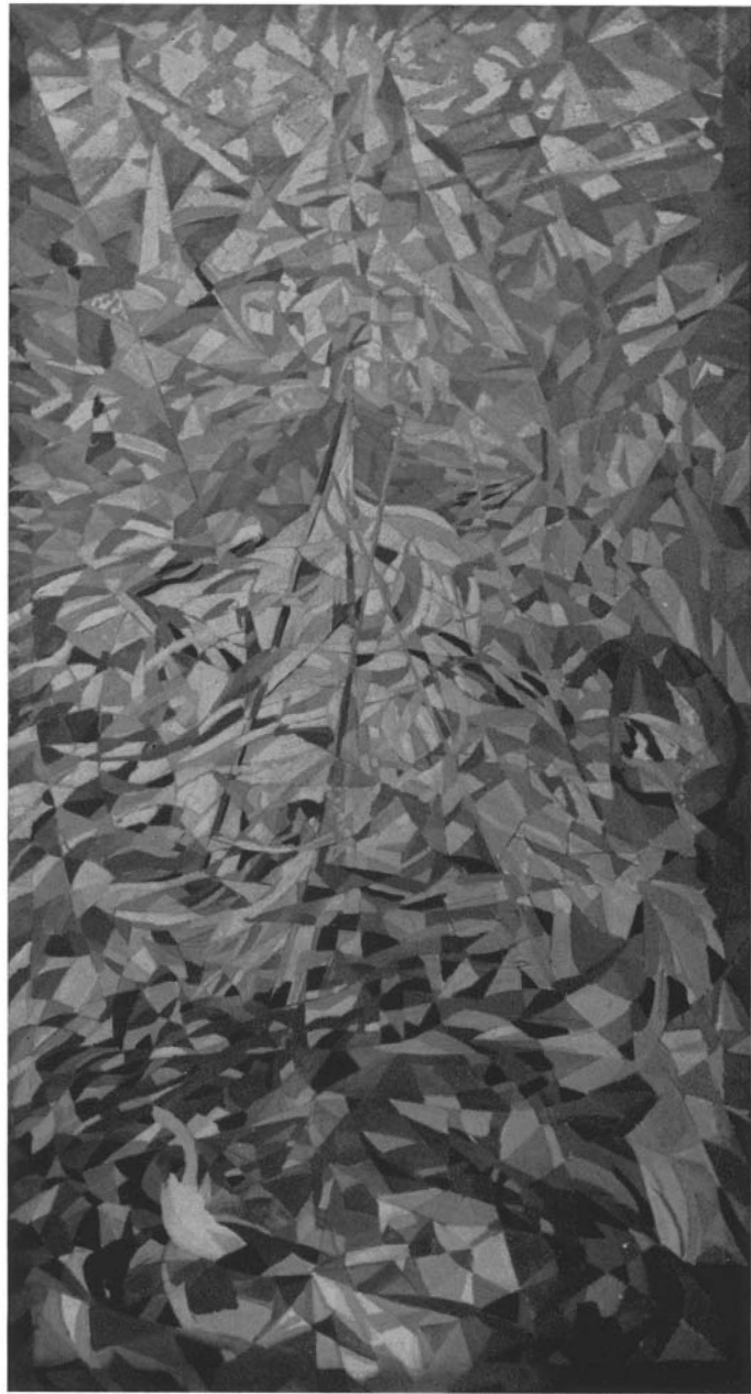
Fig. 1. Spring, 1914, by Joseph Stella (1880-1946), American