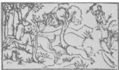
a—Laelaps Turning into a Tree, Metamorphoses , Paris, 1539 (p. 286)