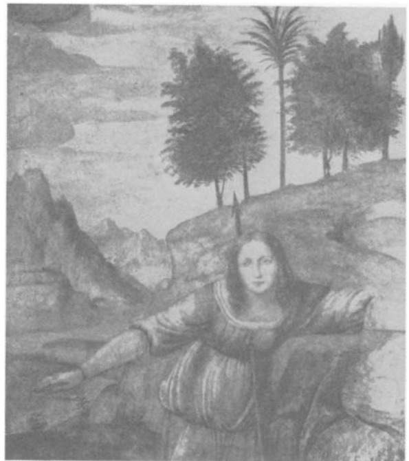
d—Death of Procris (Act IV) ( pp. 260, 274)