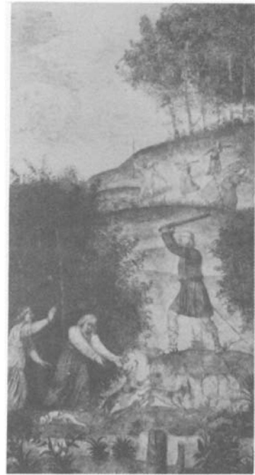
b—Cefalo and the Dogs (Act II) ( pp. 260, 275)