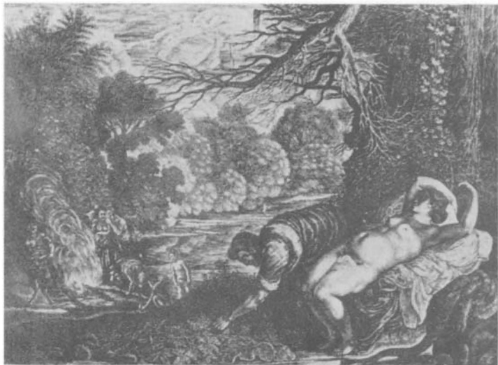
c—Magdalena de Passe, 'Death of Procris,' Engraving, Brussels, 1677 (p. 286)