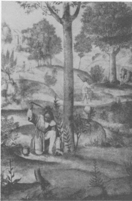
c—Cefalo and the Treasure (Act I) ( pp. 260, 275)