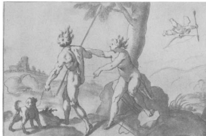
b—A. Scacciati, After Malosso, 'Aurora and Cephalus,' Aquatint (p. 284)