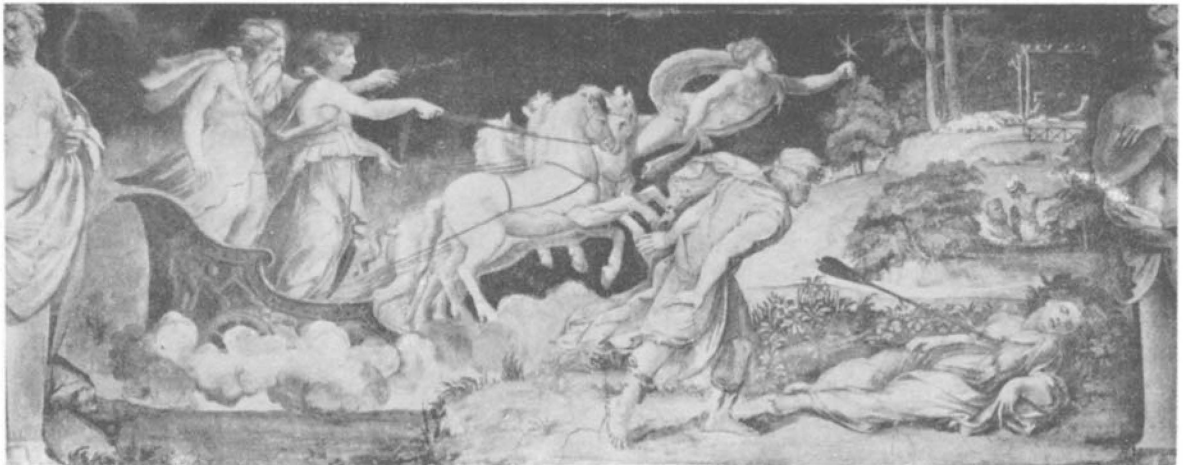
e—Peruzzi (attr.), 'Aurora and Cephalus, and the Death of Procris,' Sala delle Prospettive, Farnesina, Rome (pp. 264, 282)