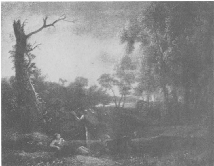
a—Claude Lorraine, 'Death of Procris,' London, National Gallery (p. 285)