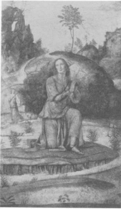
a—Procris (Act II) ( pp. 260, 273)