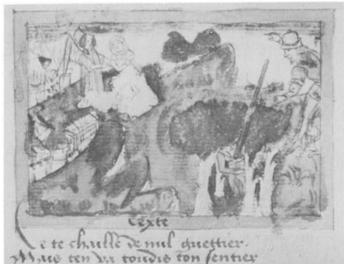
b—Death of Procris, Christine de Pisan, Épître d'Othéa , Oxford, Bodley MS. 421, f. 53 v (p. 265)