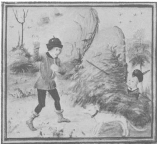
c—Cephalus Killing Procris, Ovide Moralisé , Paris, Bibl. Nationale, MS. fr. 137, f. 90 v (p. 287)