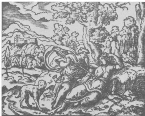
d—Virgil Solis after Salomon, Death of Procris, Metamorphoses , Frankfurt, 1563 (p. 287)