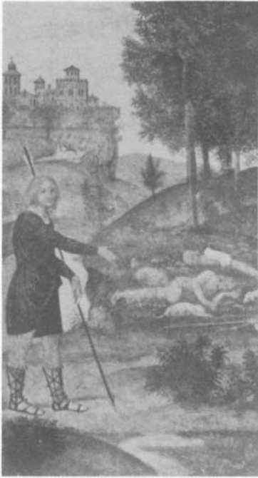
a—Cefalo and the Nymphs (Act IV) ( pp. 260, 274, 278)