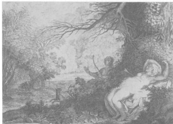
d—Picart and van Gunst, 'Death of Procris,' Engraving, Amsterdam, 1732 (p. 286)