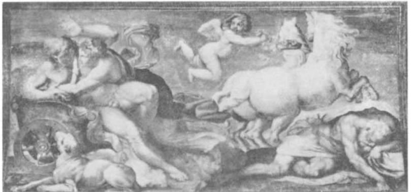
d—Agostino Carracci, 'Aurora and Cephalus,' Galleria Farnese, Rome (p. 280)