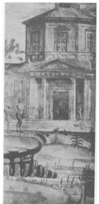
e—The Temple of Diana (Act V) ( pp. 260, 277)