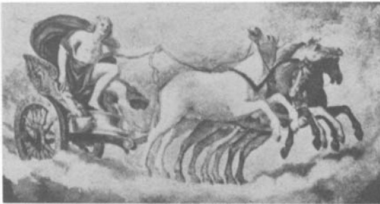
b—Domenichino, 'Apollo,' Palazzo Costaguti, Rome ( p. 284)