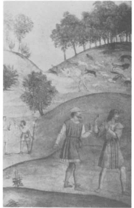
b—Cefalo and the Shepherd (Act II) ( pp. 260, 274)