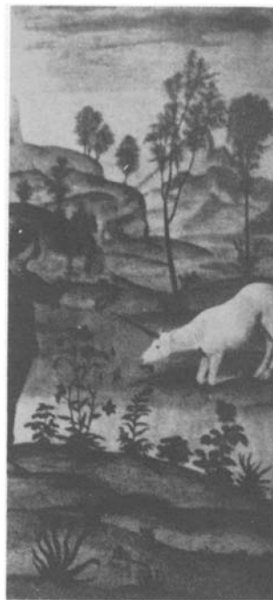
d—Procris and the Unicorn (Act V) ( pp. 260, 275)