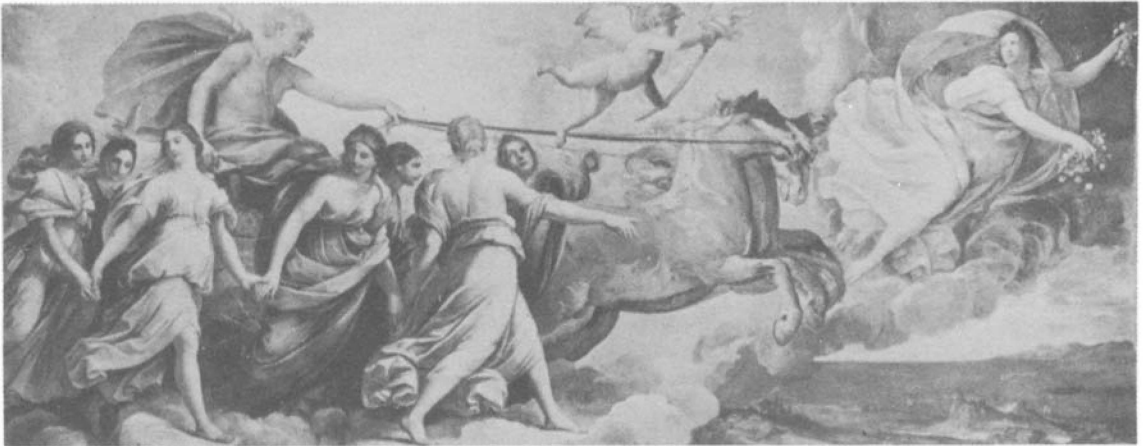
a—Guido Reni, 'Aurora,' Palazzo Rospigliosi, Rome ( p. 284)