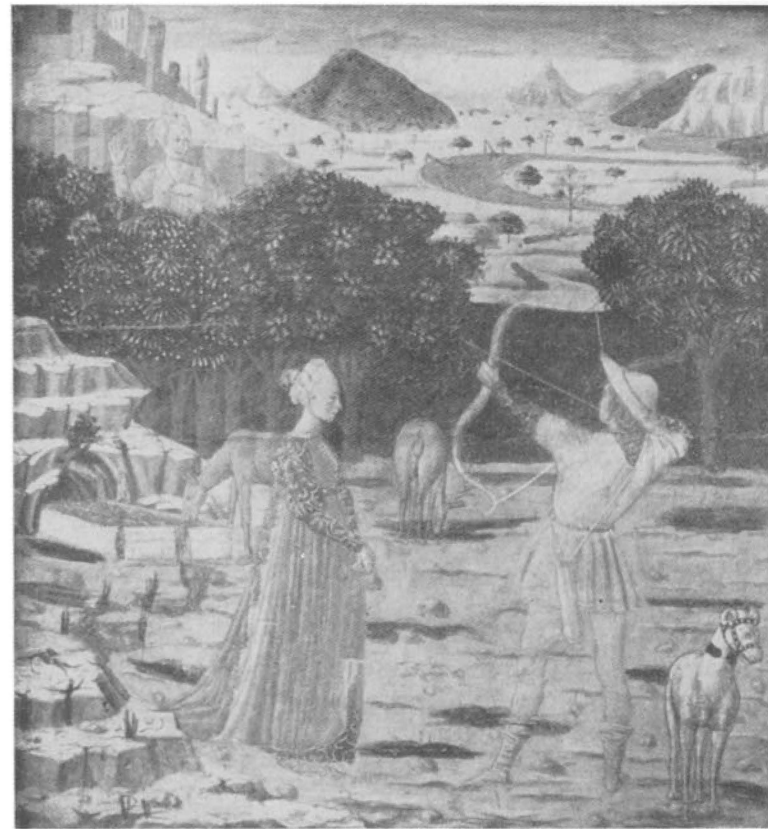
c—'Cephalus and Procris,' Florentine Painting, 15th cent.; Musée, Lille (p. 271)