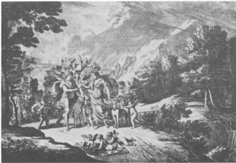
f—Le Pautre, 'Cephalus Receiving the Gifts,' Engraving (p. 287)