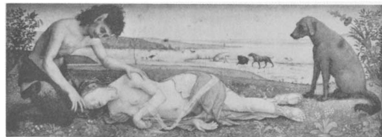
d—'Death of Procris,' Piero di Cosimo, National Gallery, London (p. 271)