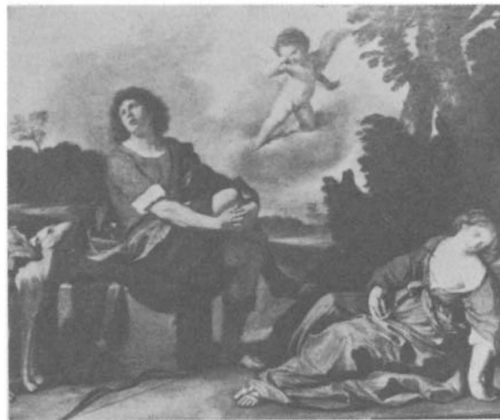
d—Guercino, 'Death of Procris,' Dresden (p. 285)