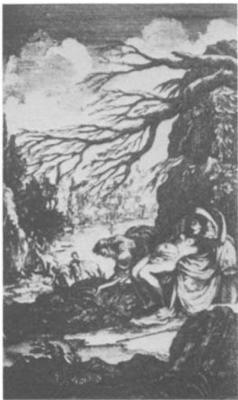
e—Death of Procris, Metamorphoses , The Hague, 1728 (p. 286)