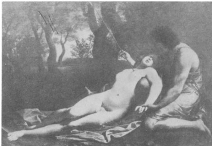
a—Follower of Guido Reni, 'Death of Procris,' Brunswick (p. 285)