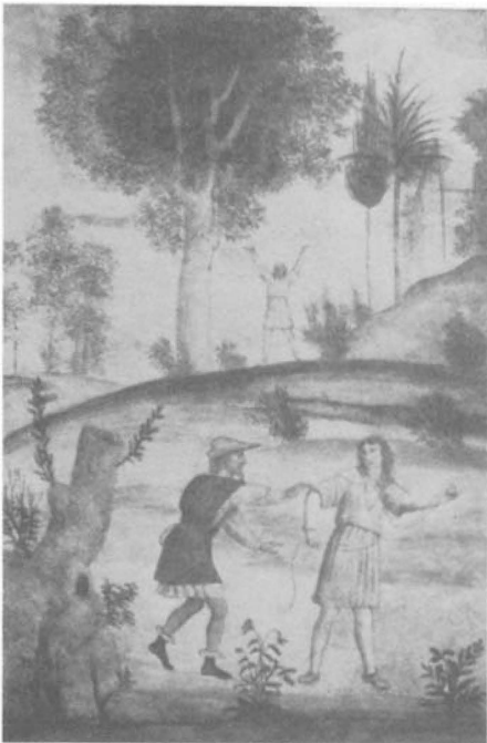
c—Cefalo and the Shepherd (Act II) ( pp. 260, 274)