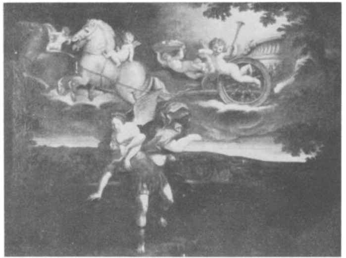
b—School of Francesco Albani, 'Aurora Raping Cephalus,' Galleria Estense, Modena (p. 281)