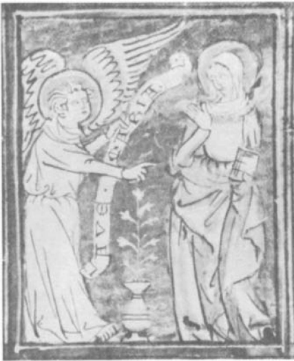
a—The Annunciation, Ovide Moralisé , Paris, Arsenal MS. 5069, f. 105 r (p. 277)