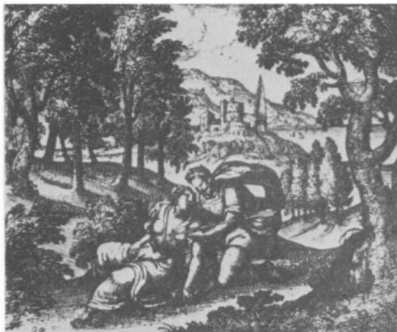
c—P. van der Borcht, 'Death of Procris,' Etching, Amsterdam, 1591 (p. 285)