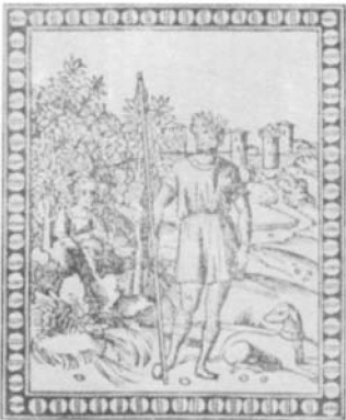
c—Illustration to Cefalo , Venice, 1521 (p. 278)