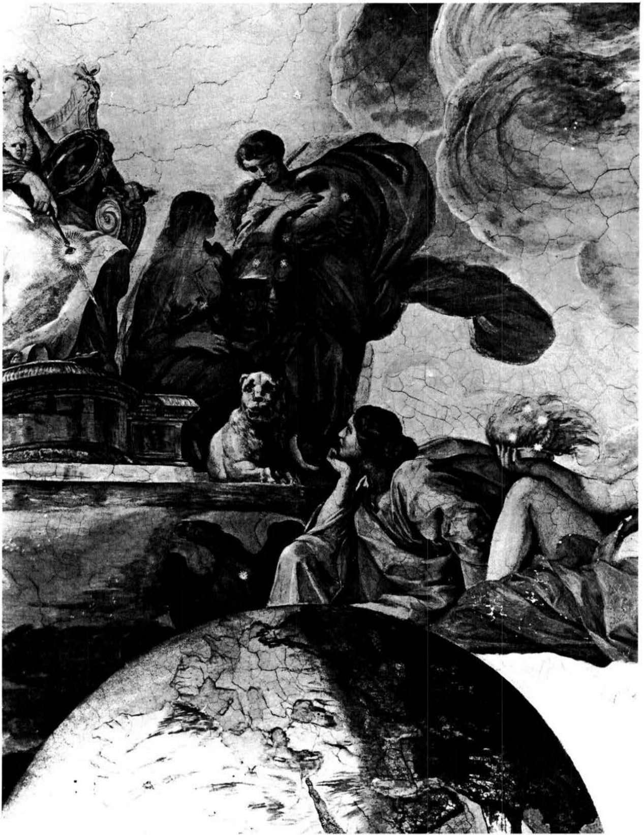
FIG. 9. Detail of Fig. 8