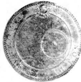
FIG. 6. Medal of Carlo Spinelli, 1564. London, British Museum