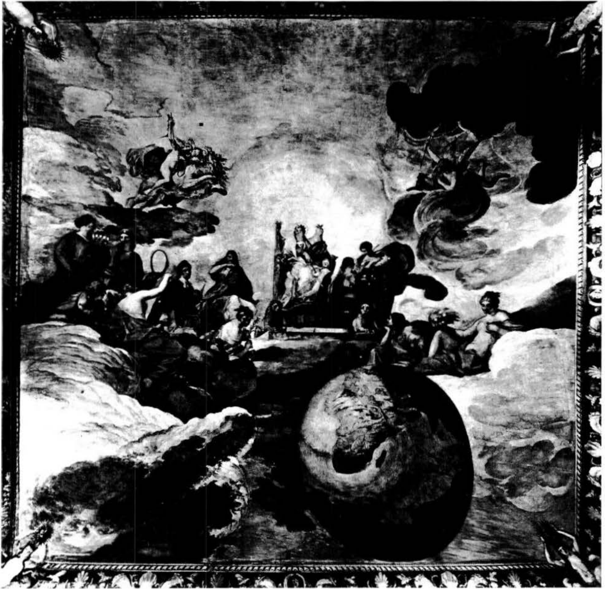
FIG. 8. ANDREA SACCHI, Allegory of Divine Wisdom . Rome, Palazzo Barberini