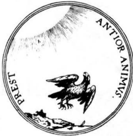
FIG. 4. Emblem of Philibert II, Duke of Savoy, from Typotius, Symbola , III (Prague, 1603), 25 (detail)