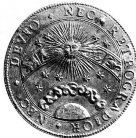
FIG. 7. Medal of Carlo Gonzaga, 1628. London, British Museum