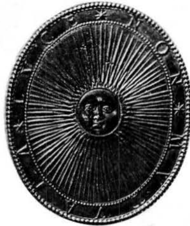
FIG. 5. Medal of Ferdinando Gonzaga (d. 1626). London, British Museum