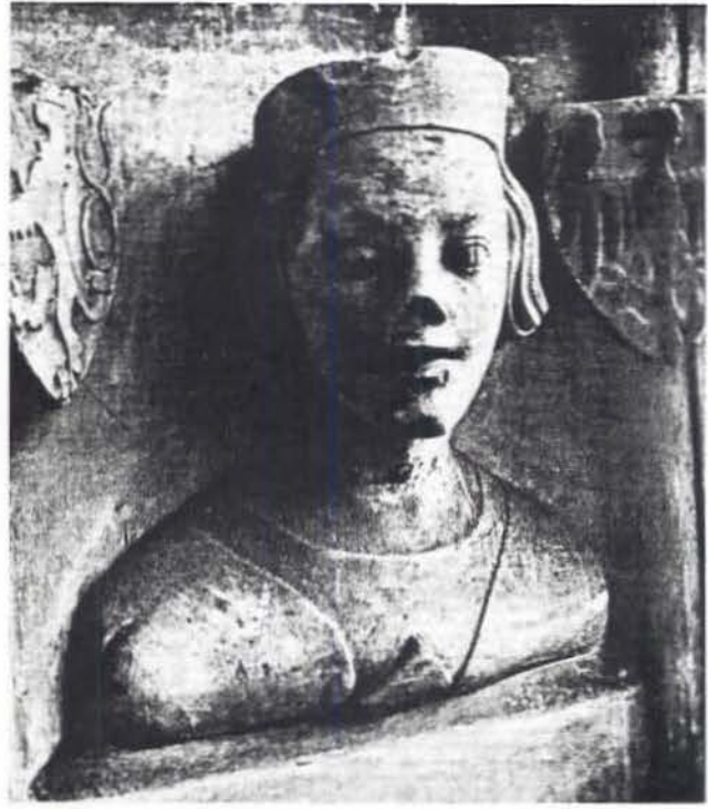
Fig. 11. Bust of Wenceslaus I Cathedral, Prague