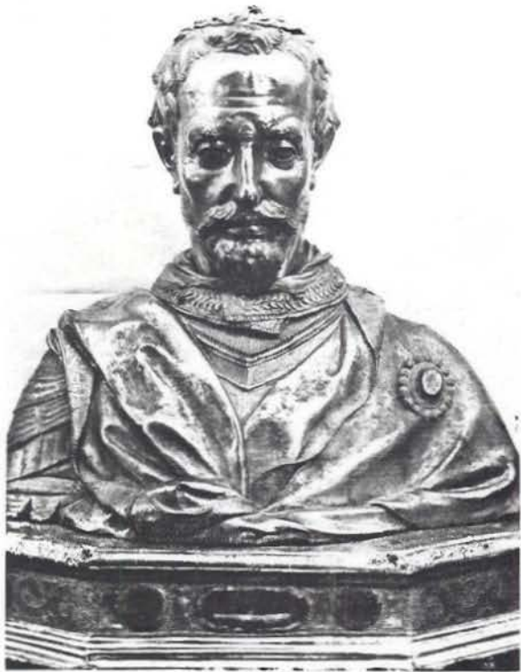
Fig. 14. DONATELLO, Reliquary Bust of St. Rossore Musco di S. Matteo, Pisa