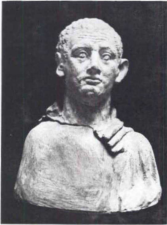
Fig. 10. Terracotta Bust of a Man Museo Nazionale delle Terme, Rome