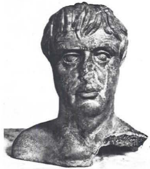
Fig. 6. Votive Terracotta from the Temple of Vignale, Falerii Veteres Museo Nazionale di Villa Giulia, Rome