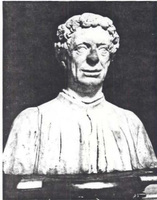
Fig. 16. ANTONIO ROSSELLINO, Bust of Matteo Palmieri Museo Nazionale, Florence