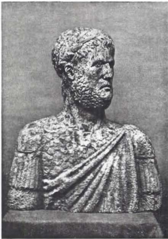
Fig. 12. Bust of a Man Cathedral, Acerenza