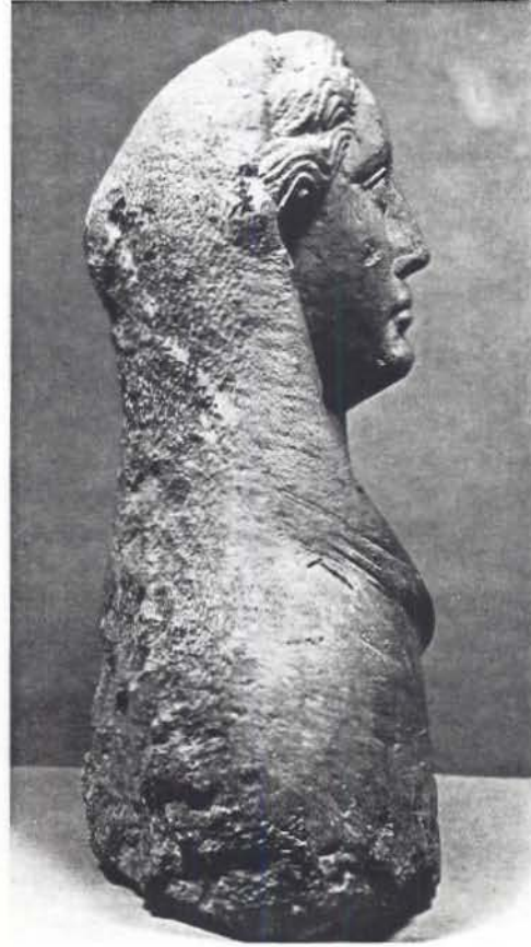
Fig. 8. Bust from a Tomb at Palestrina (front and side), Museo Etrusco Gregoriano, Vatican, Rome