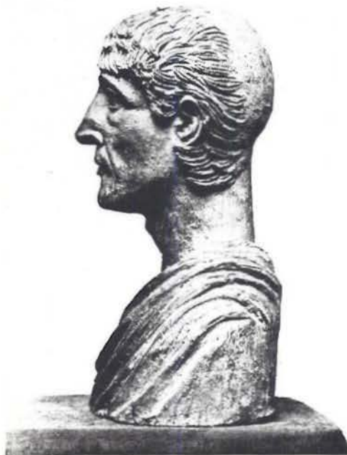
Fig. 9. Terracotta Bust of a Man (front and side), Staatliche Museen, Berlin