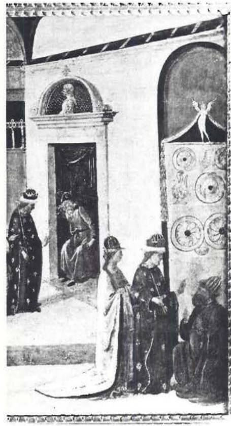
Fig. 4. JACOPO DEL SELLAIO Scene from the Story of Esther (detail) Galleria degli Uffizi, Florence