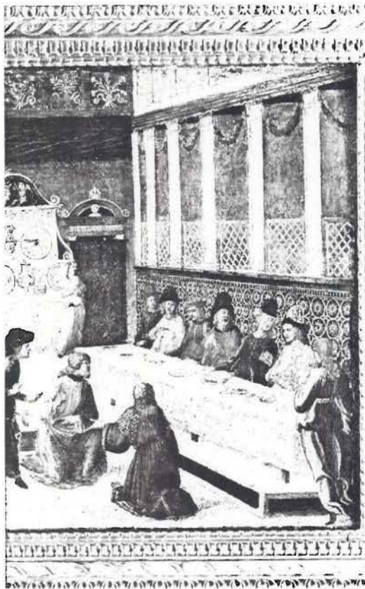
Fig. 3. JACOPO DEL SELLAIO Scene from the Story of Esther (detail) Galleria degli Uffizi, Florence