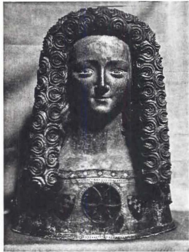
Fig. 13. Reliquary Bust of a Saint Church of St. Ursula, Cologne