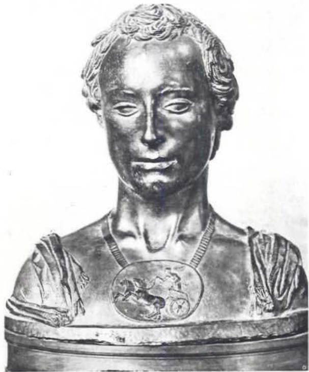
Fig. 15. DONATELLO(?), Bust of a Youth Museo Nazionale, Florence