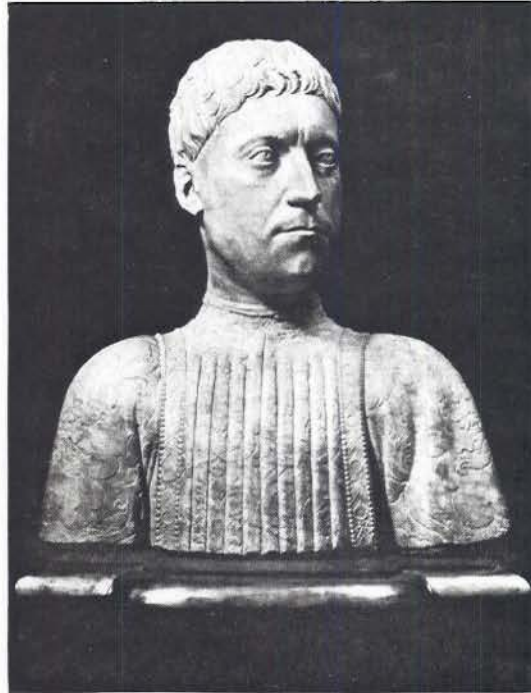
Fig. 2. MINO DA FIESOLE, Bust of Piero de' Medici Museo Nazionale, Florence