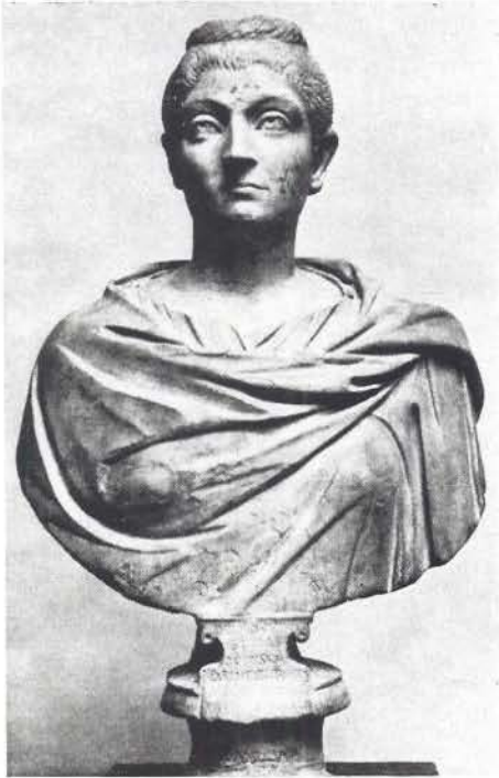
Fig. 1. Bust of Aurelia Momina Staatliche Museen, Berlin