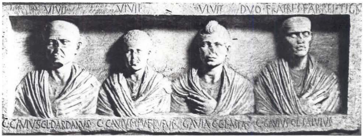
Fig. 7. Roman Tomb Monument, Cloister, San Giovanni in Laterano, Rome